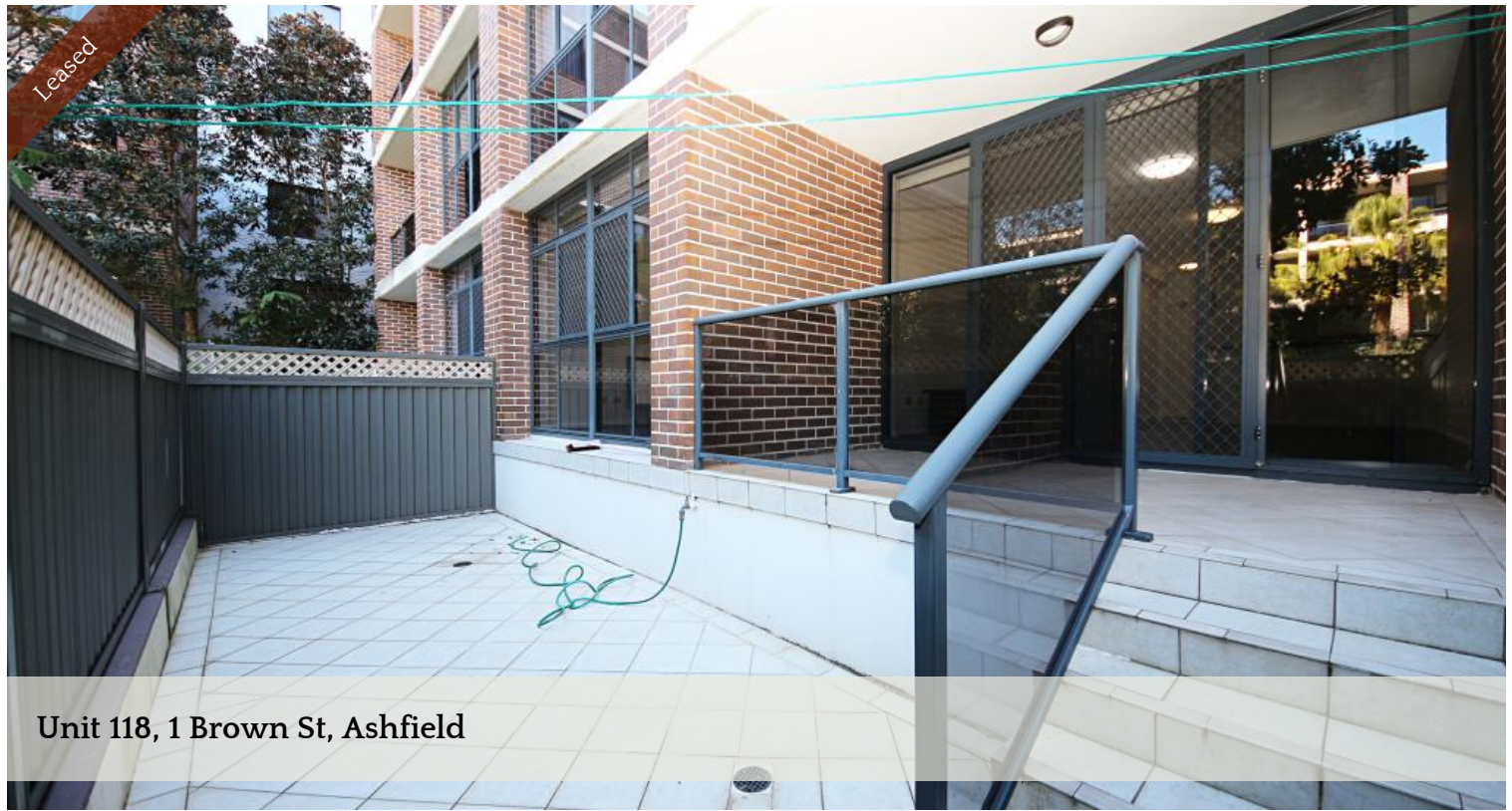
Unit 118, 1 Brown St, Ashfield