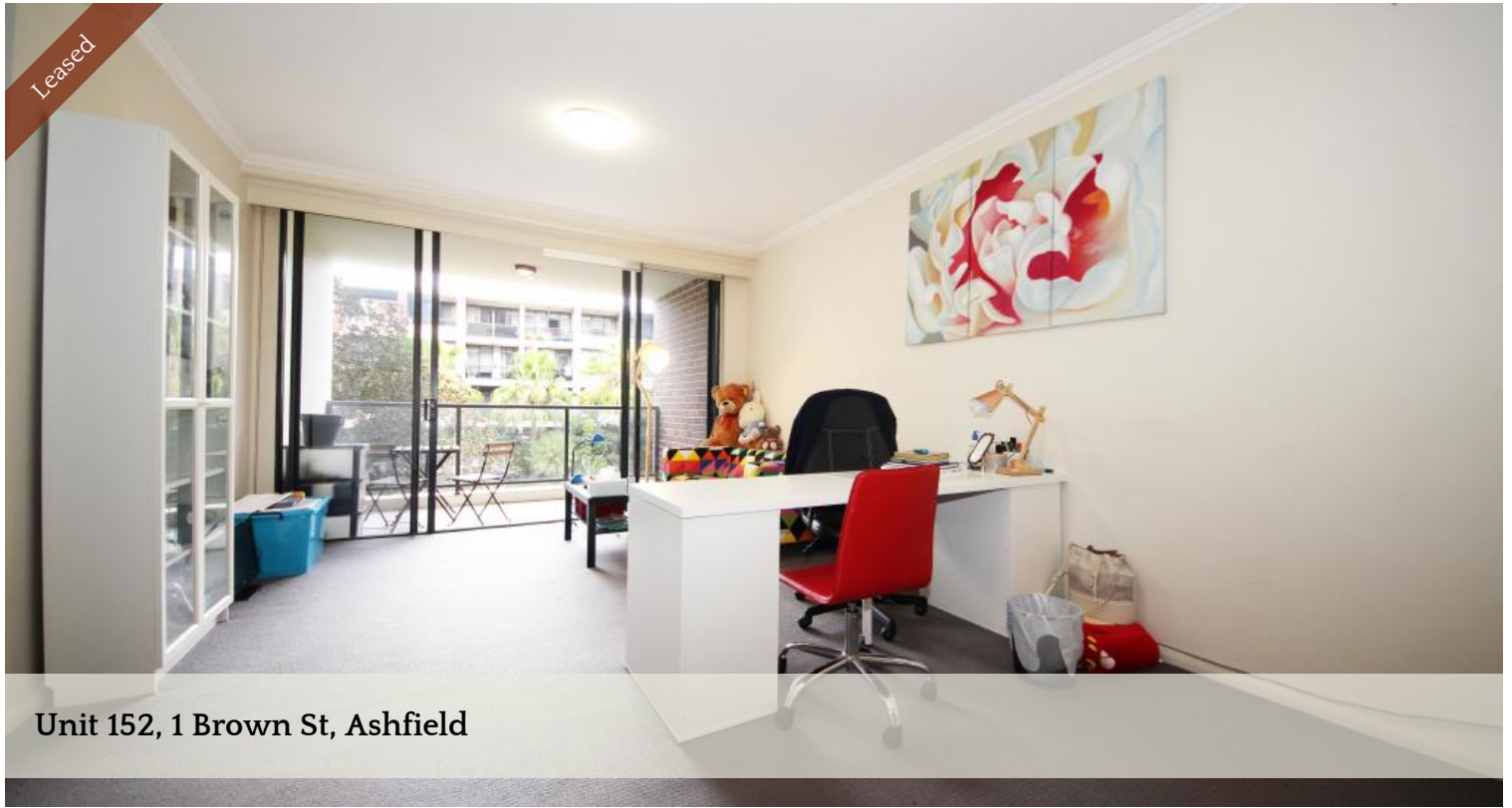
Unit 152, 1 Brown St, Ashfield