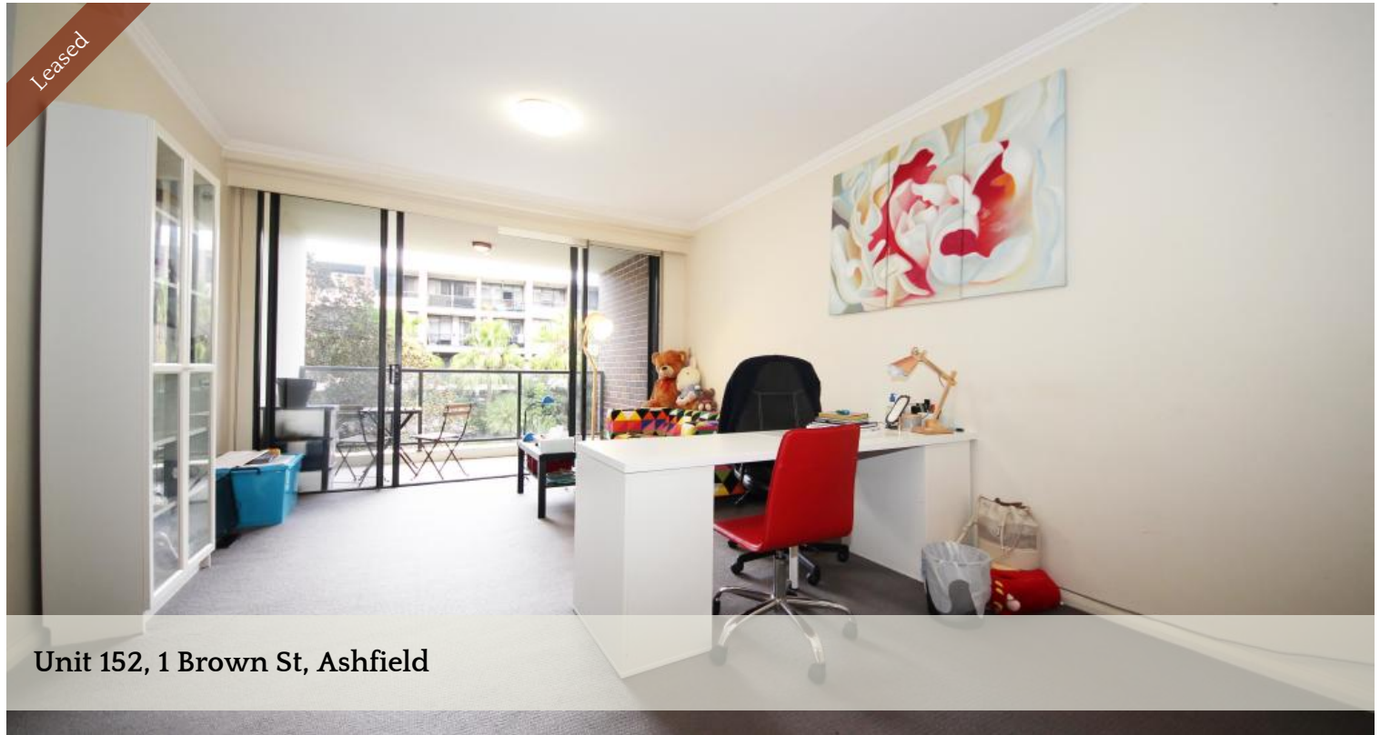
Unit 152, 1 Brown St, Ashfield