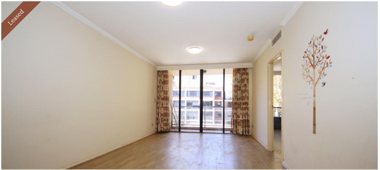
Unit 5, 1 Brown St, Ashfield