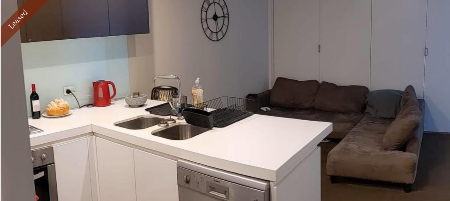
Unit 806, 507 Wattle St, Ultimo