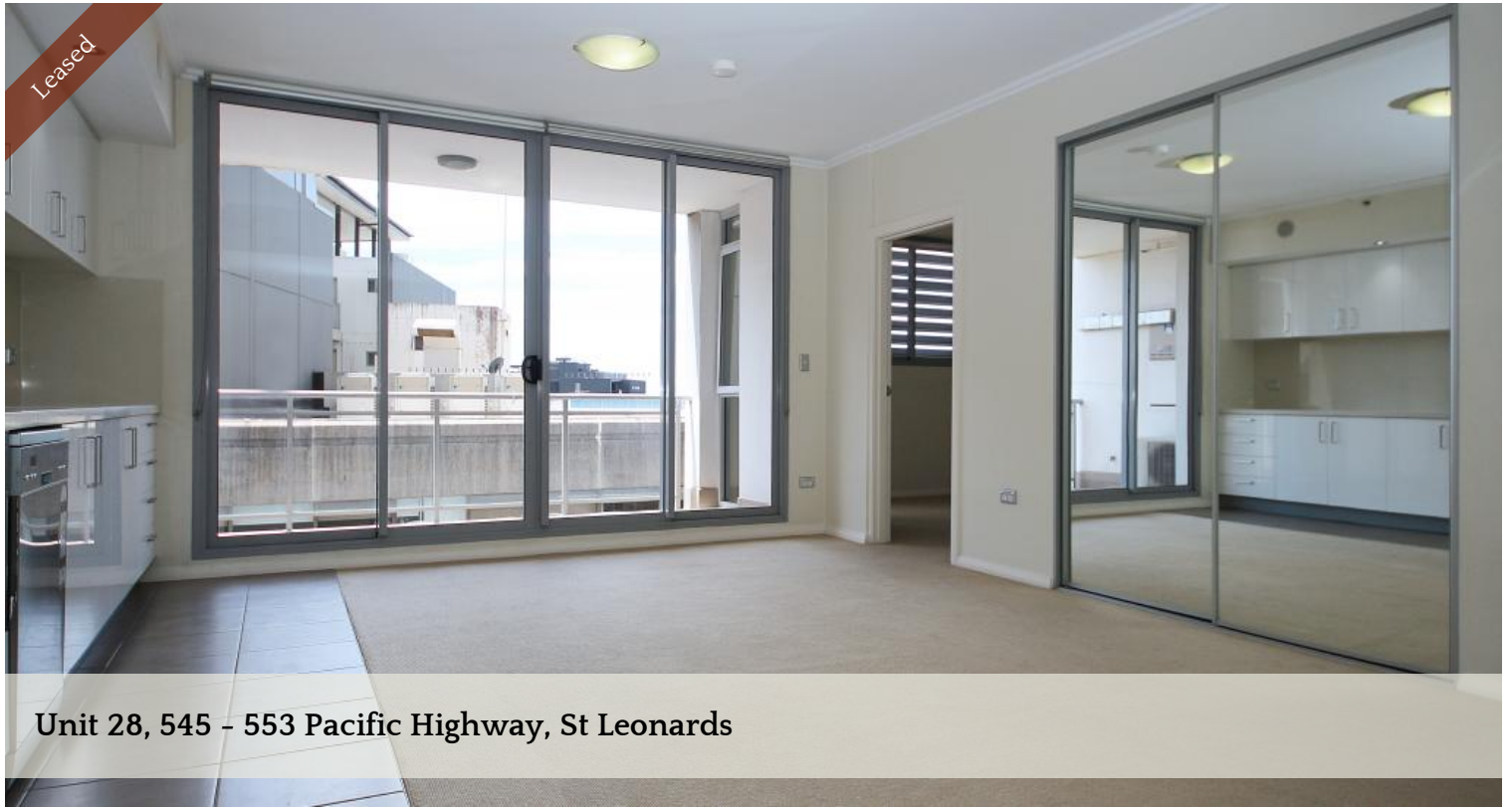
Unit 28, 545 - 553 Pacific Highway, St Leonards