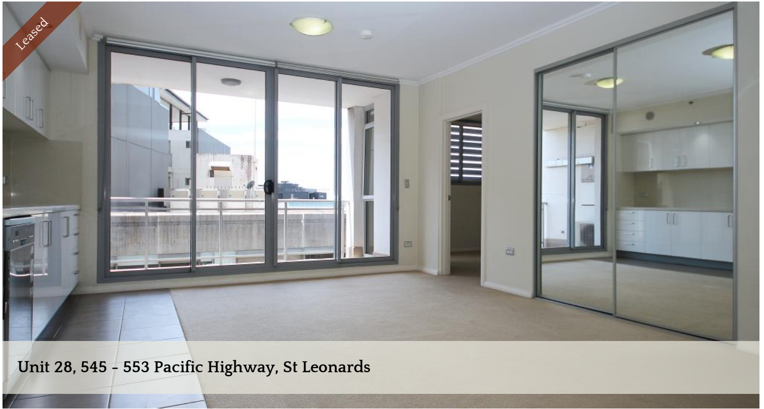
Unit 28, 545 - 553 Pacific Highway, St Leonards