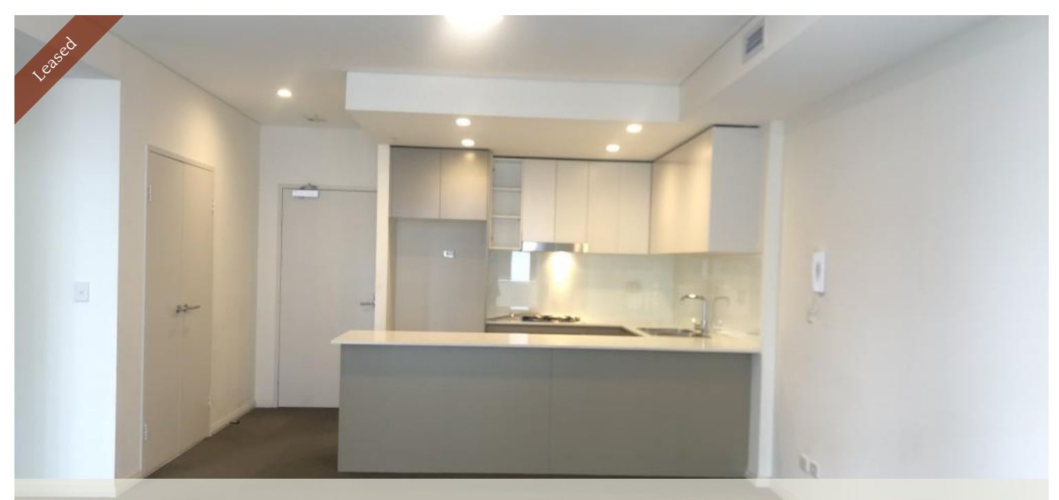
819, 2D Charles St, Canterbury