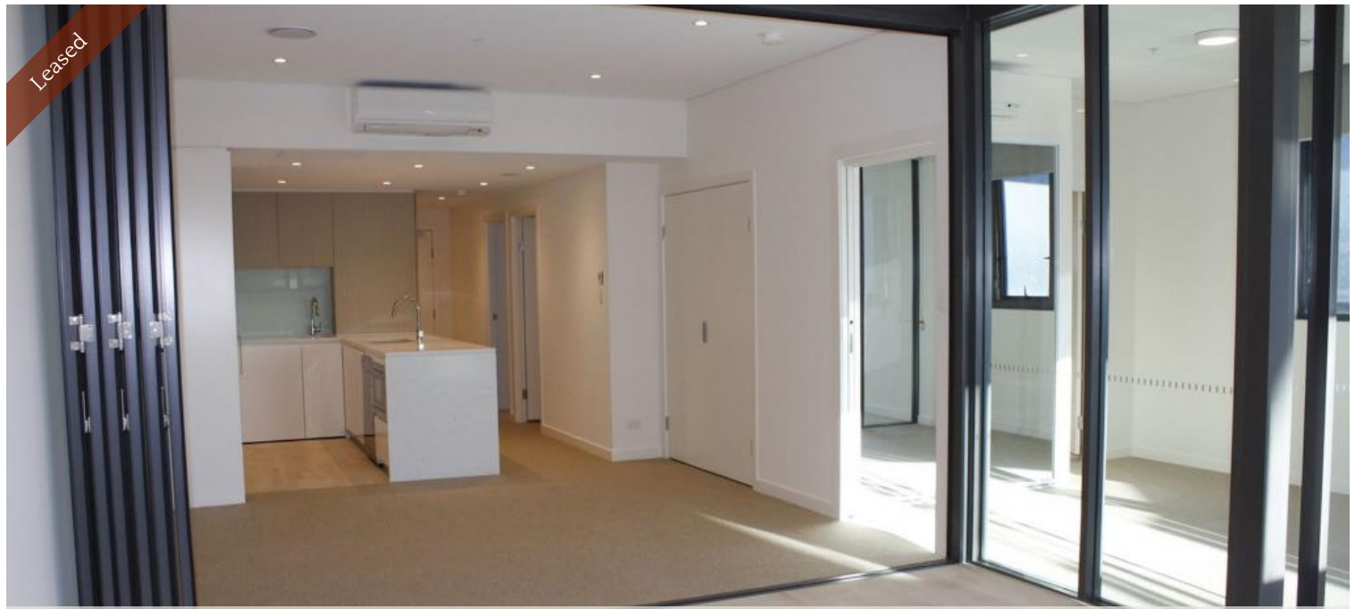
Unit 2209, 11 Wentworth Pl, Wentworth Point