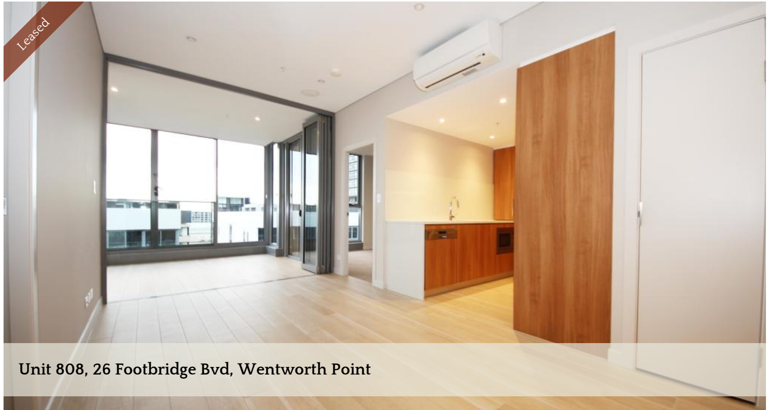
Unit 808, 26 Footbridge Bvd, Wentworth Point