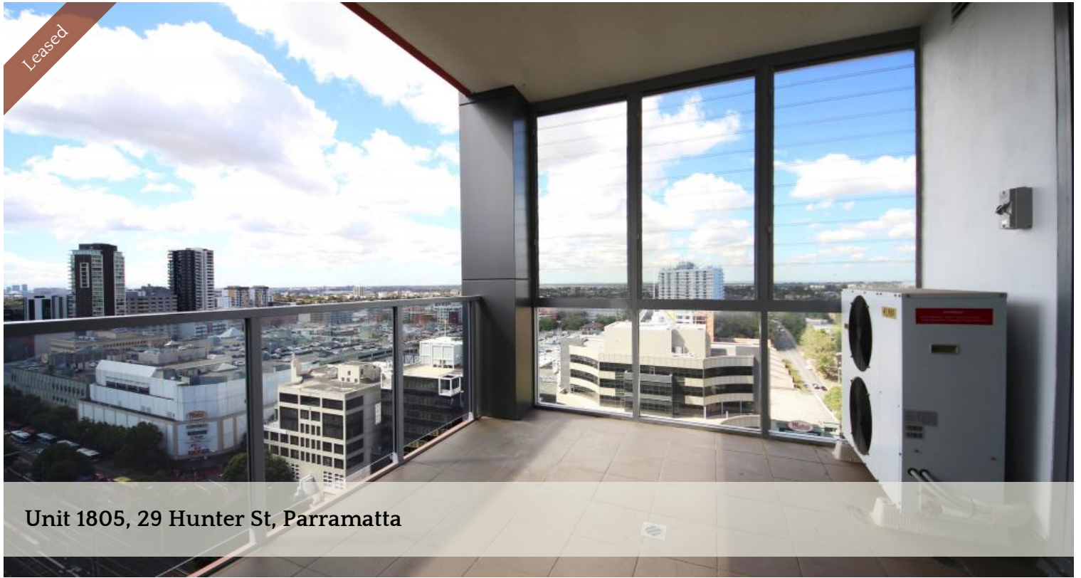
Unit 1805, 29 Hunter St, Parramatta