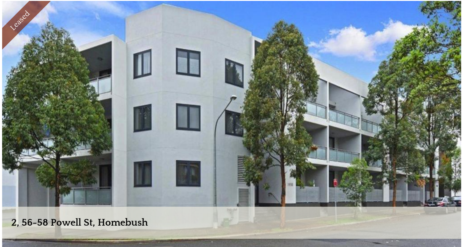
2, 56-58 Powell St, Homebush