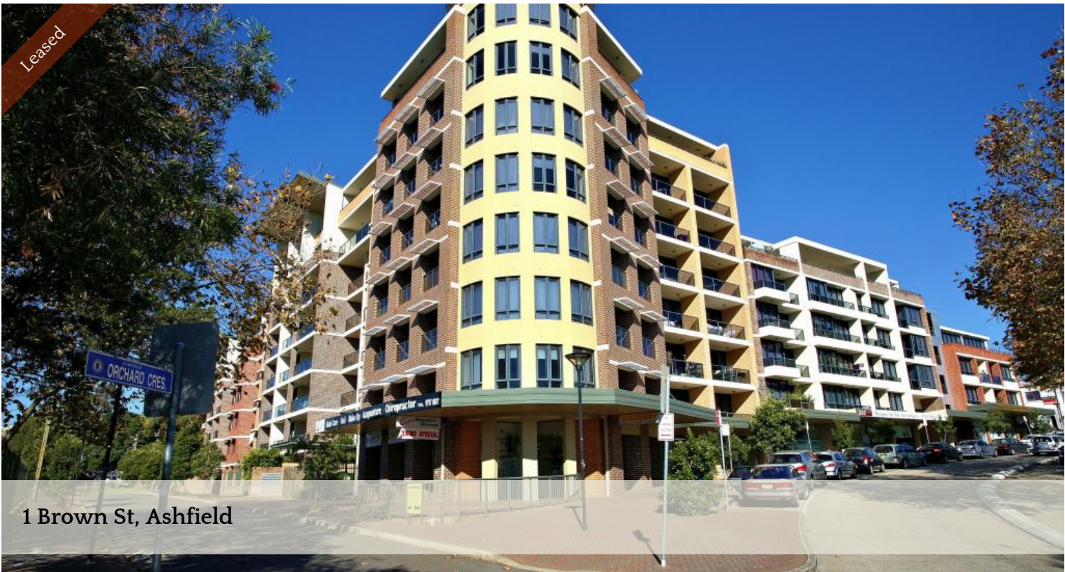
1 Brown St, Ashfield