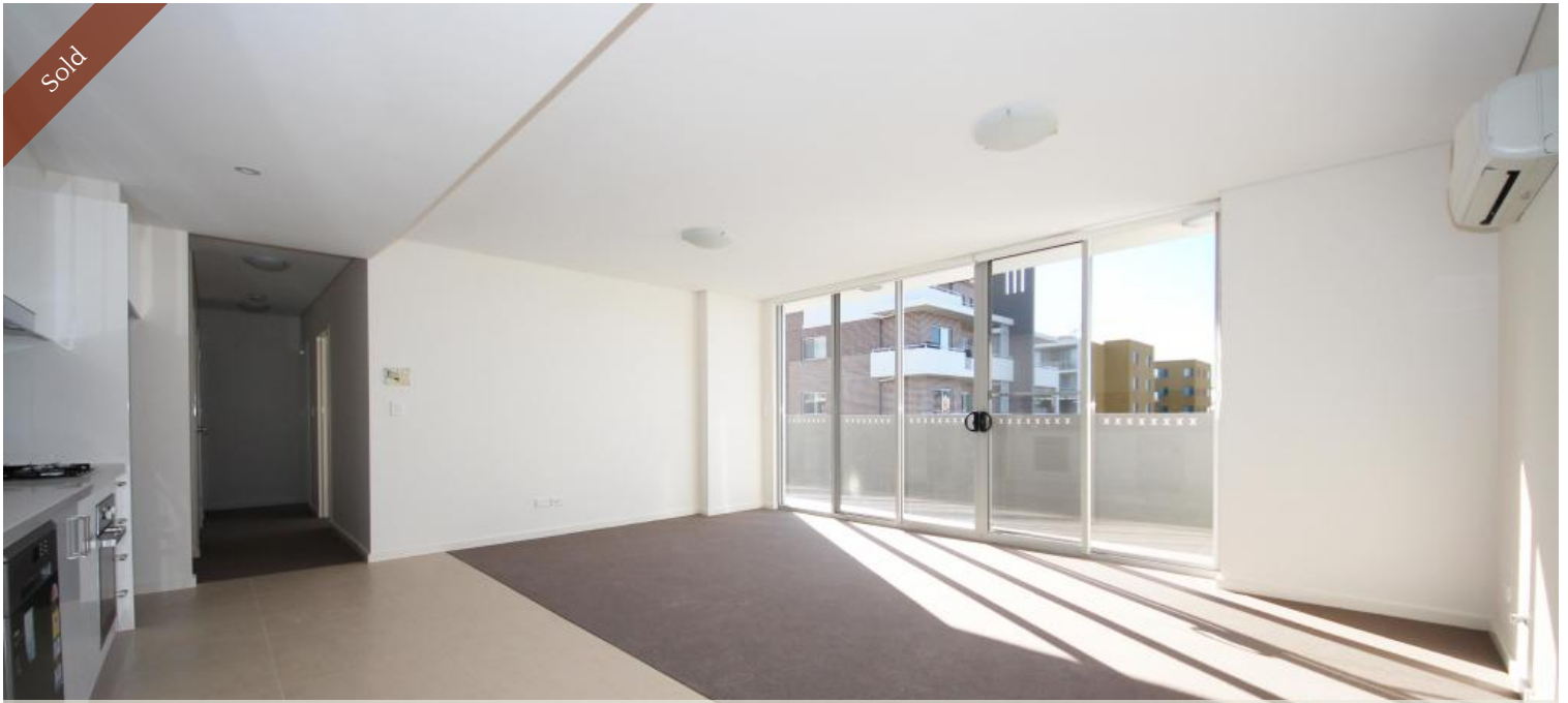
Unit 72, 87-91 Campbell St, Liverpool