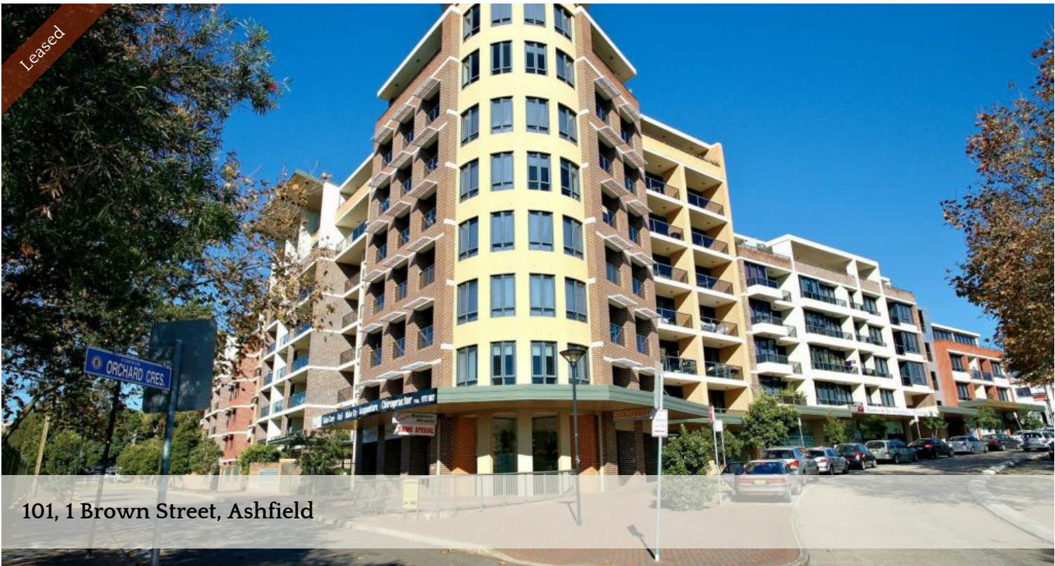
101, 1 Brown Street, Ashfield