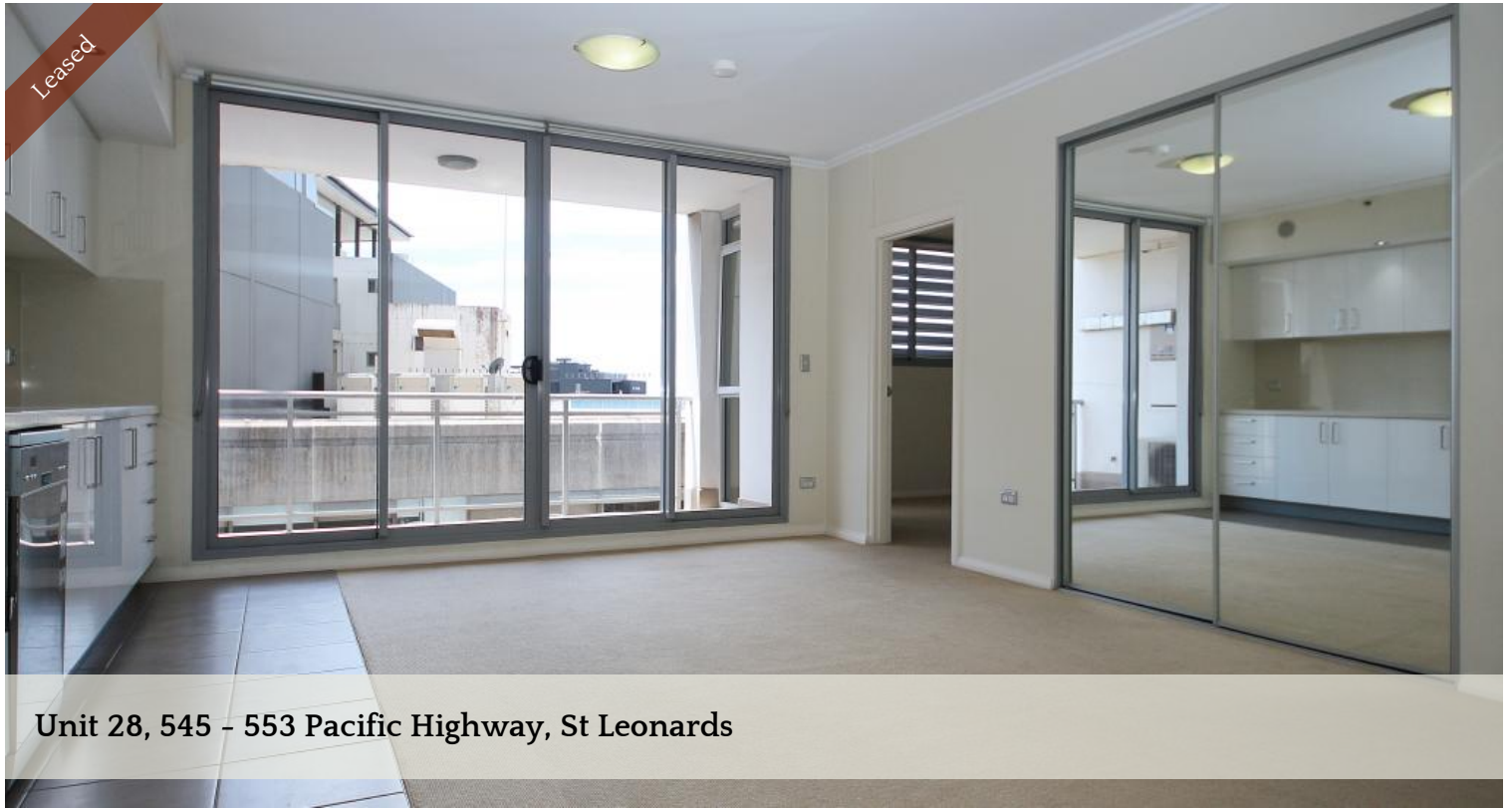
Unit 28, 545 - 553 Pacific Highway, St Leonards