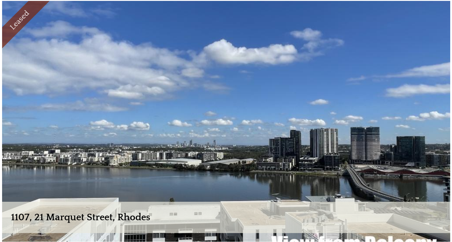
1107, 21 Marquet Street, Rhodes