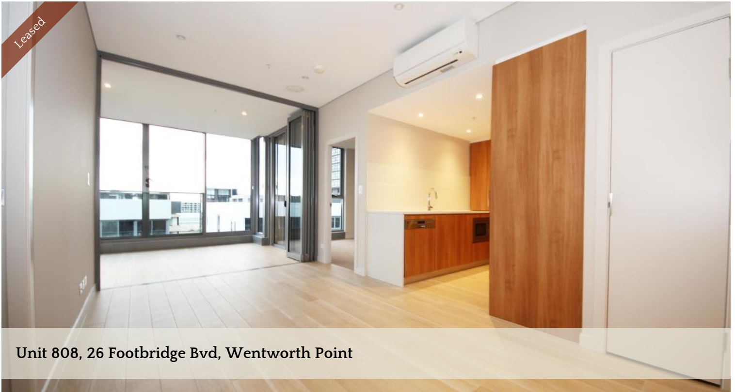
Unit 808, 26 Footbridge Bvd, Wentworth Point