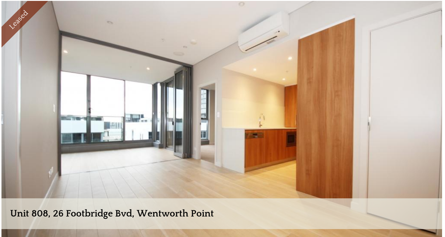
Unit 808, 26 Footbridge Bvd, Wentworth Point