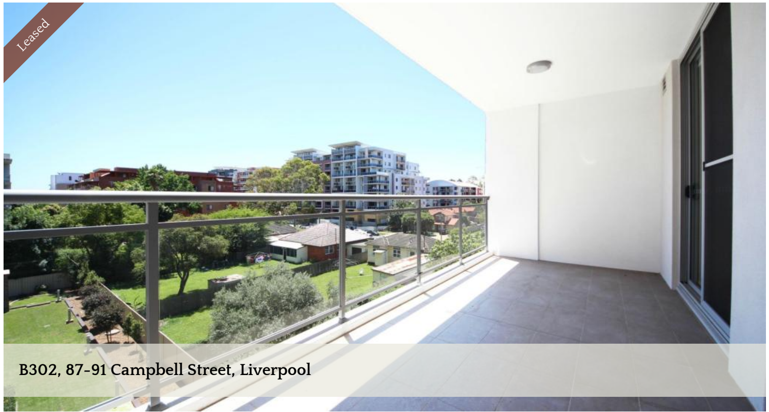
B302, 87-91 Campbell Street, Liverpool