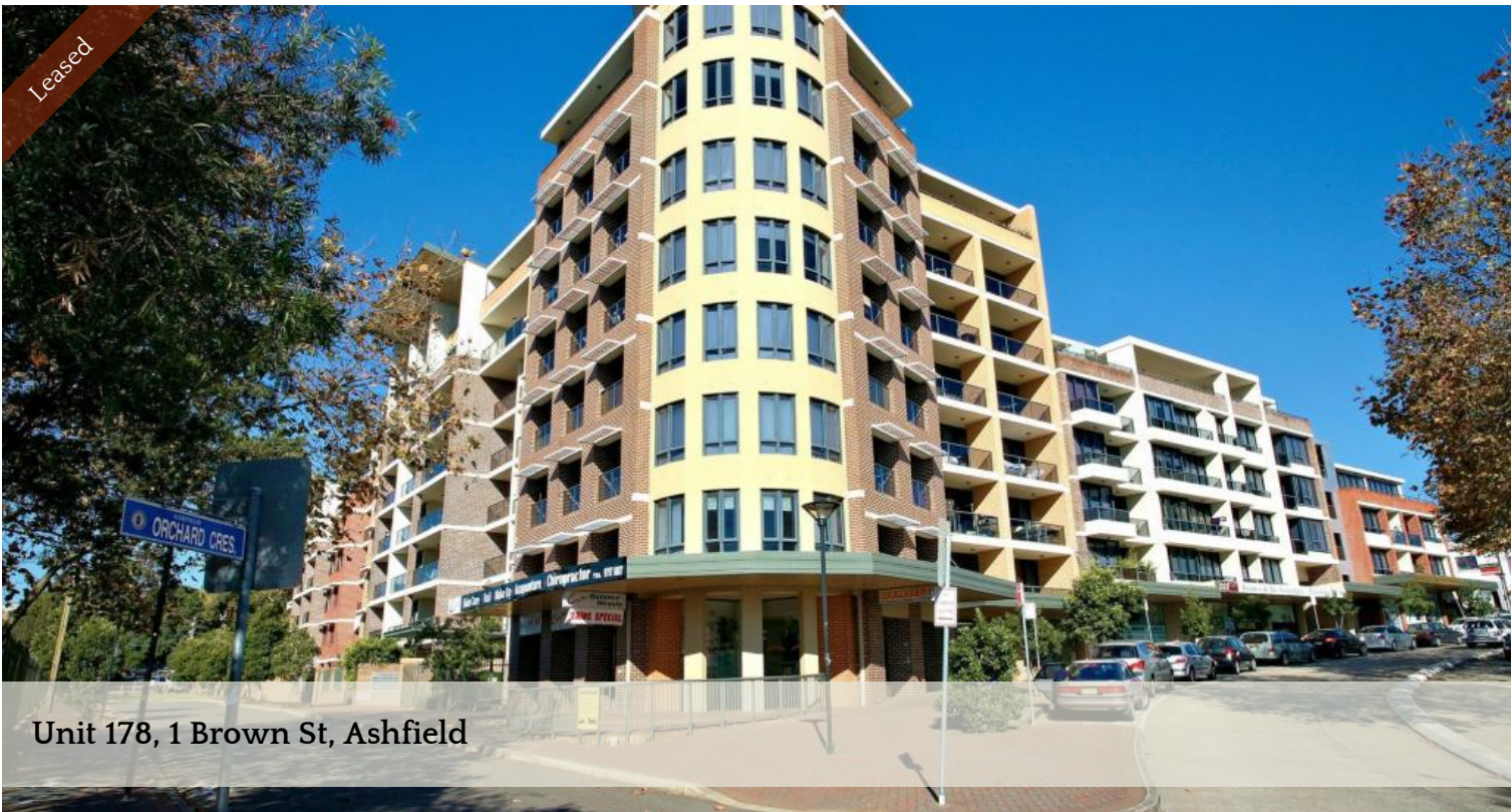
Unit 178, 1 Brown St, Ashfield