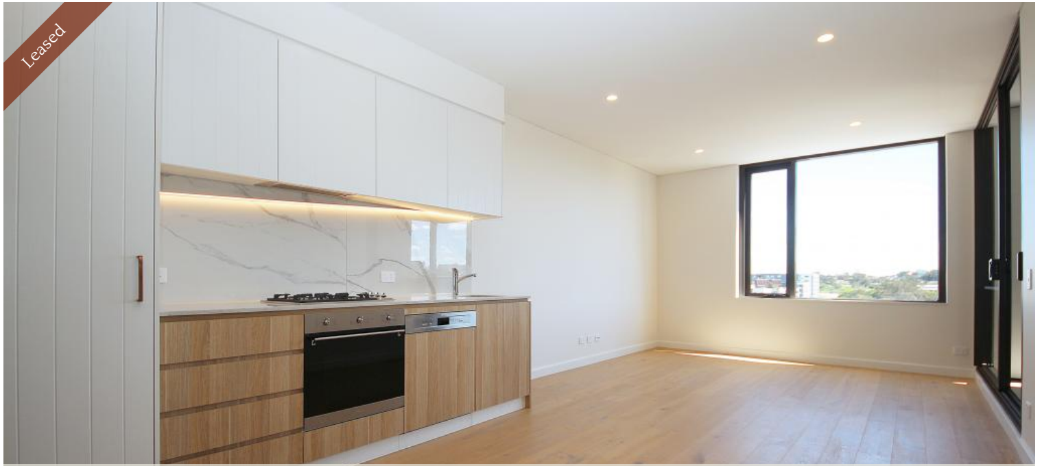
B704, 57 Ashmore Street, Erskineville