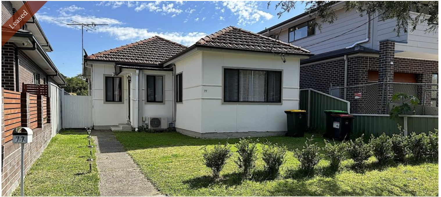
77 Balmoral Ave, Croydon Park