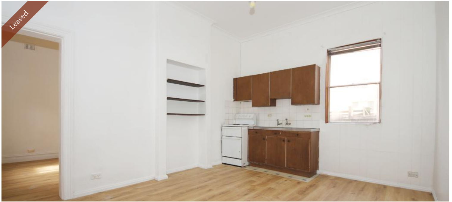
Unit7, 16A Tintern Rd, Ashfield