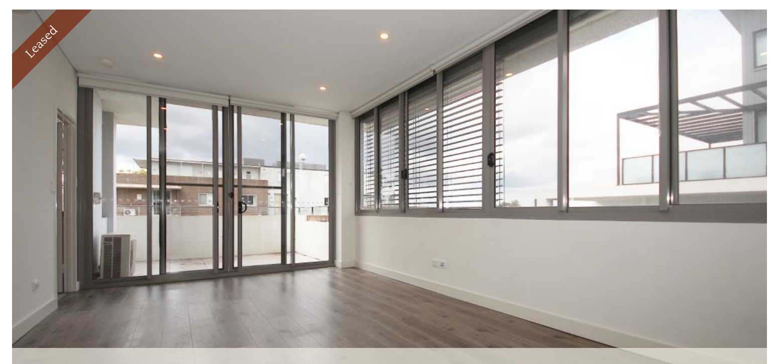
Unit 39, 2 Cowan Rd, Mount Colah