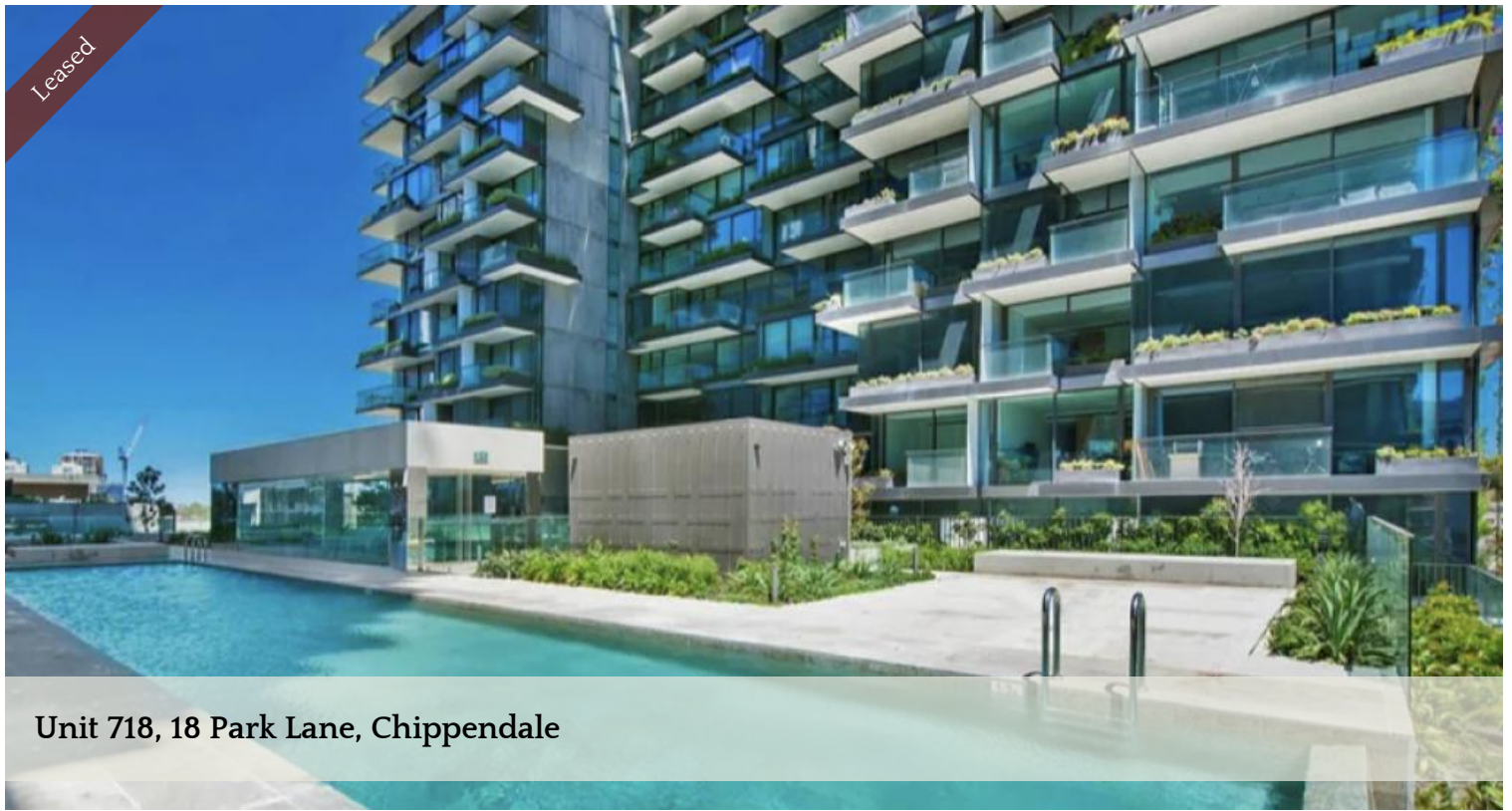
Unit 718, 18 Park Lane, Chippendale