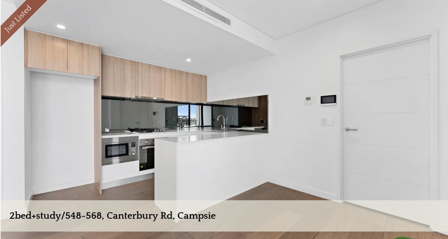
2bed+study/548-568, Canterbury Rd, Campsie