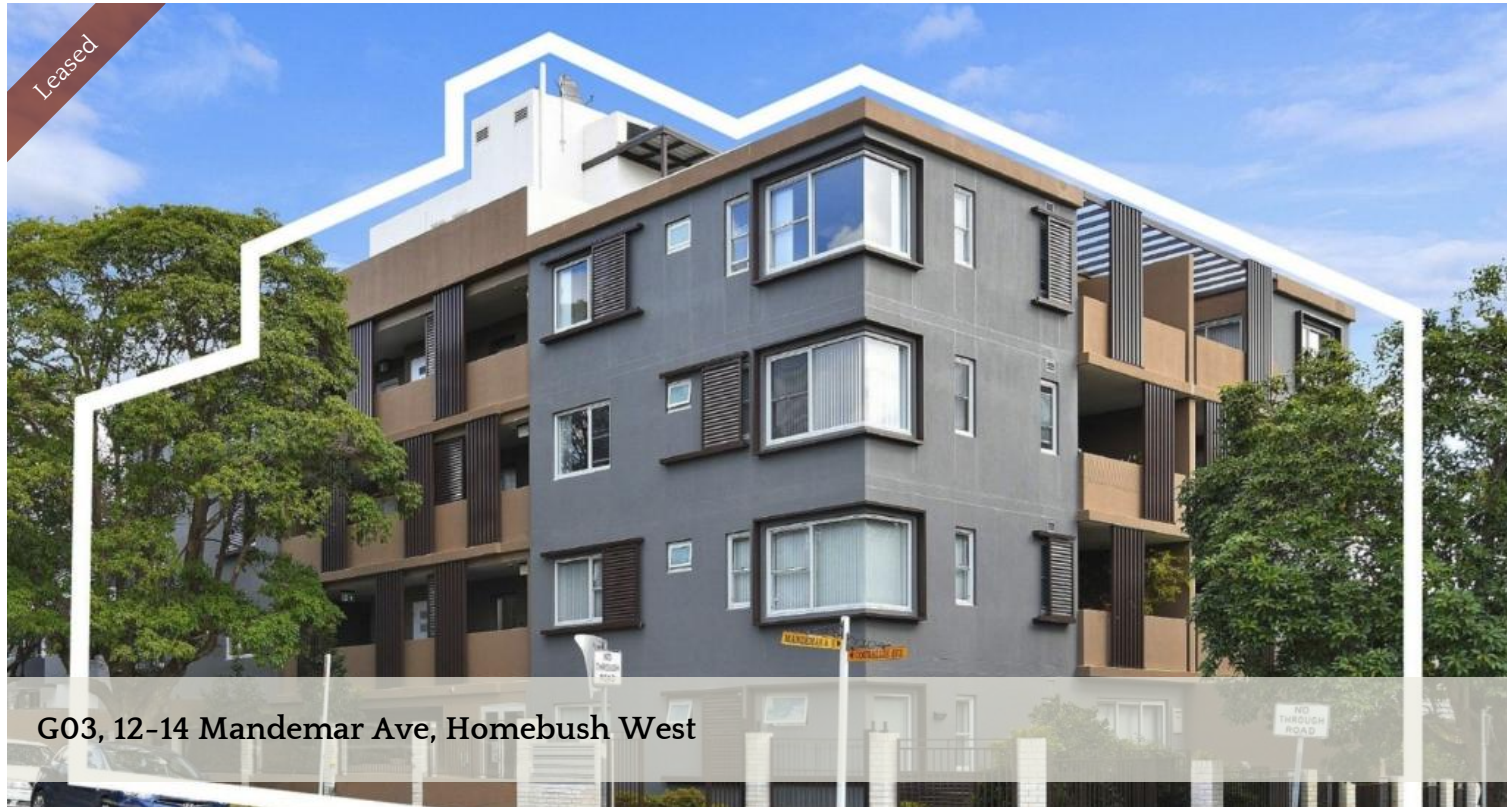
G03, 12-14 Mandemar Ave, Homebush West