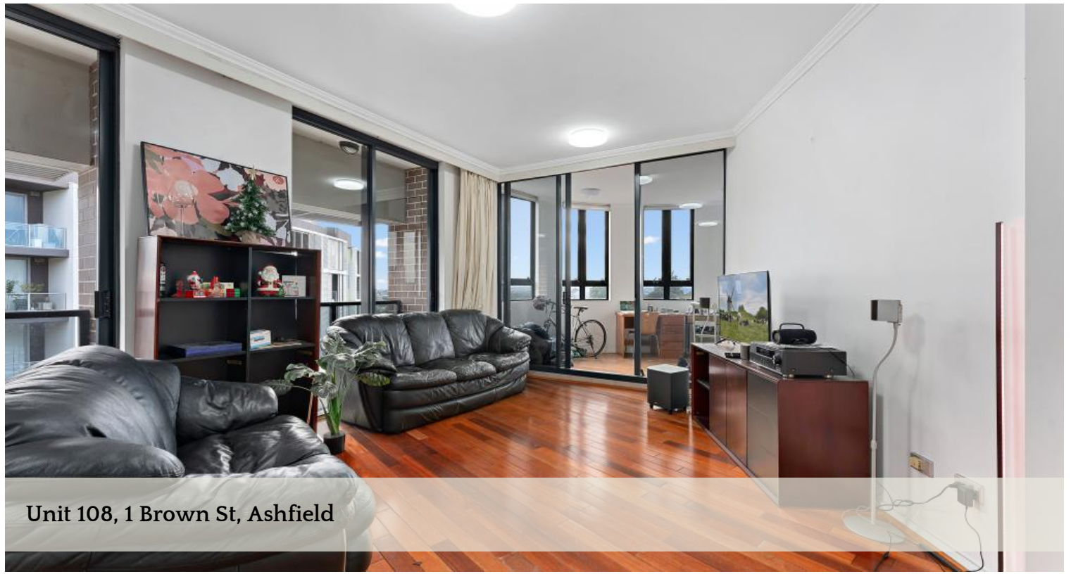
Unit 108, 1 Brown St, Ashfield