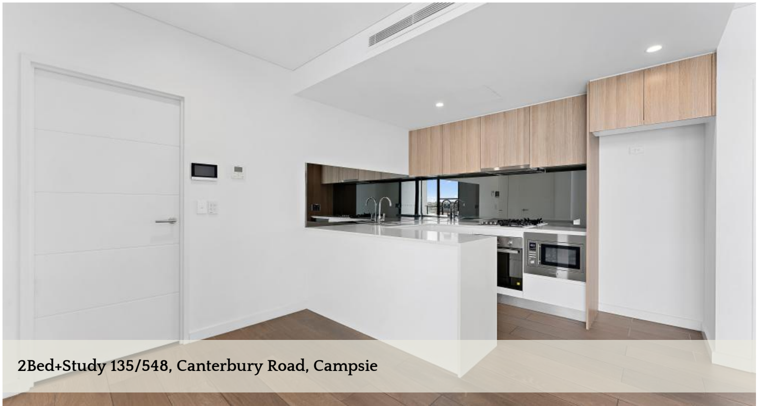
2Bed+Study 135/548, Canterbury Road, Campsie