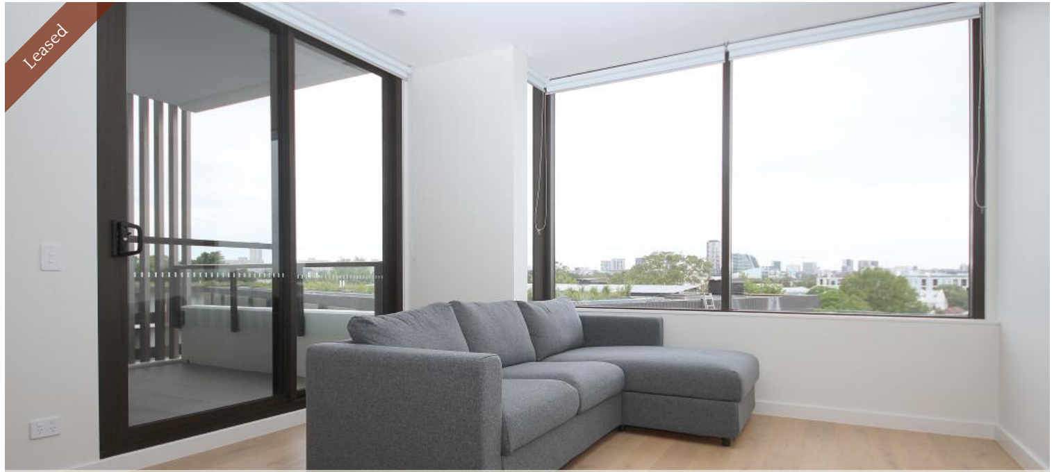
C514, 4 Foundry Street, Erskineville