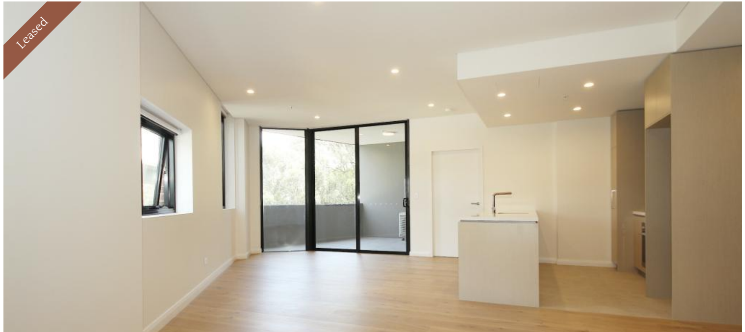
Unit 103, 32 Civic Way, Rouse Hill