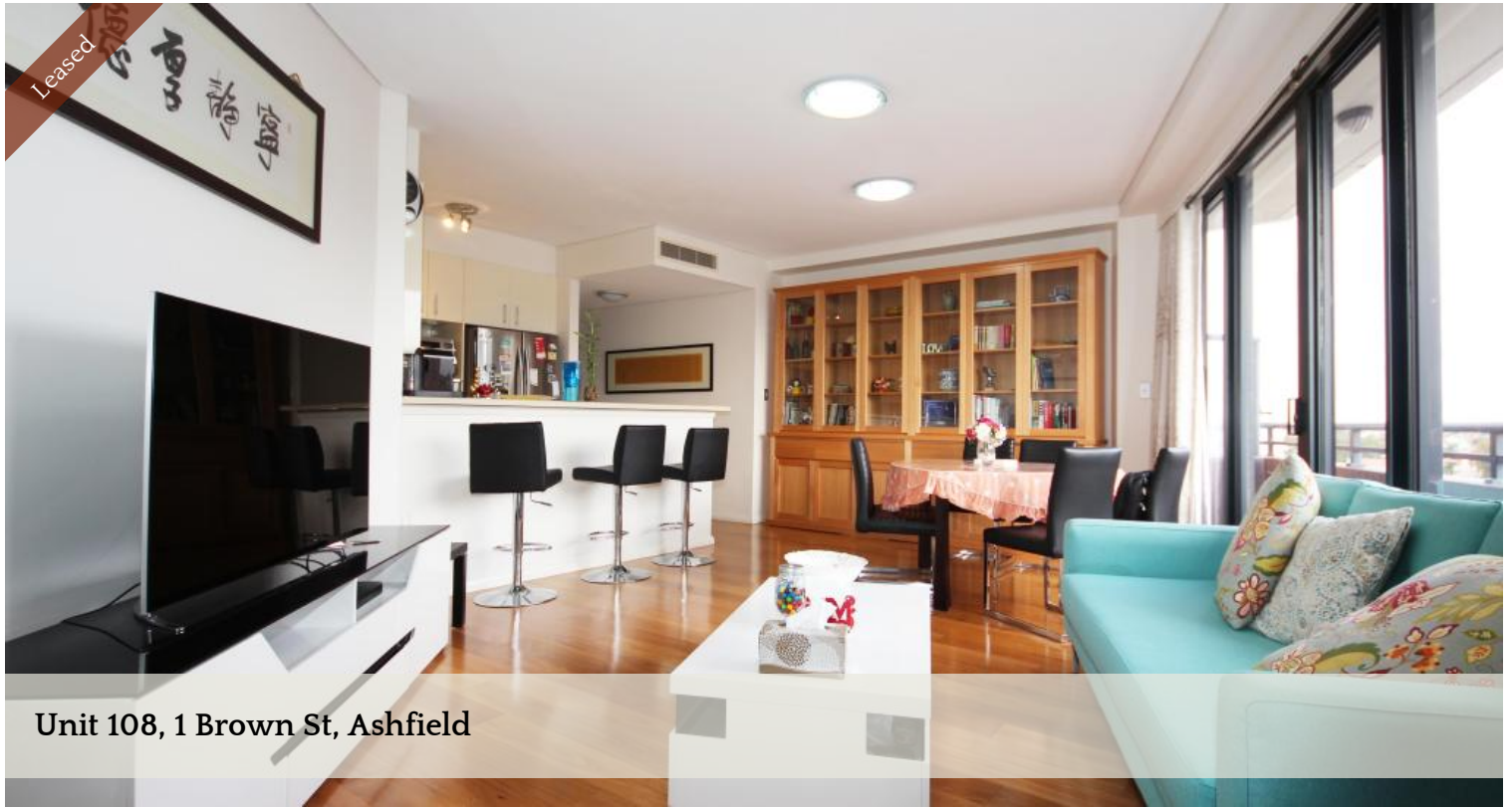
Unit 108, 1 Brown St, Ashfield