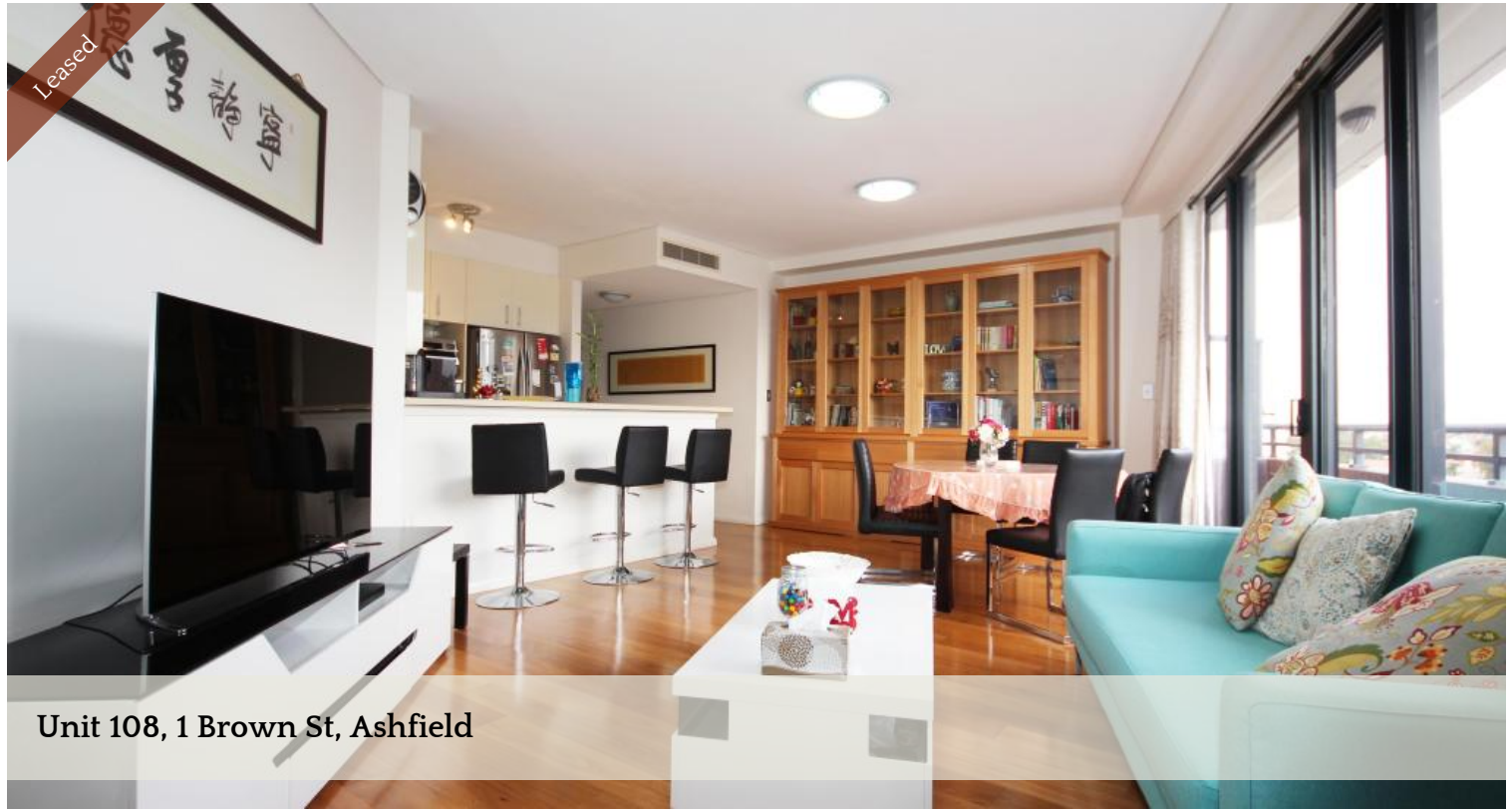
Unit 108, 1 Brown St, Ashfield