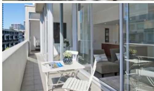
Unit 25, 1 Defries Ave, Zetland