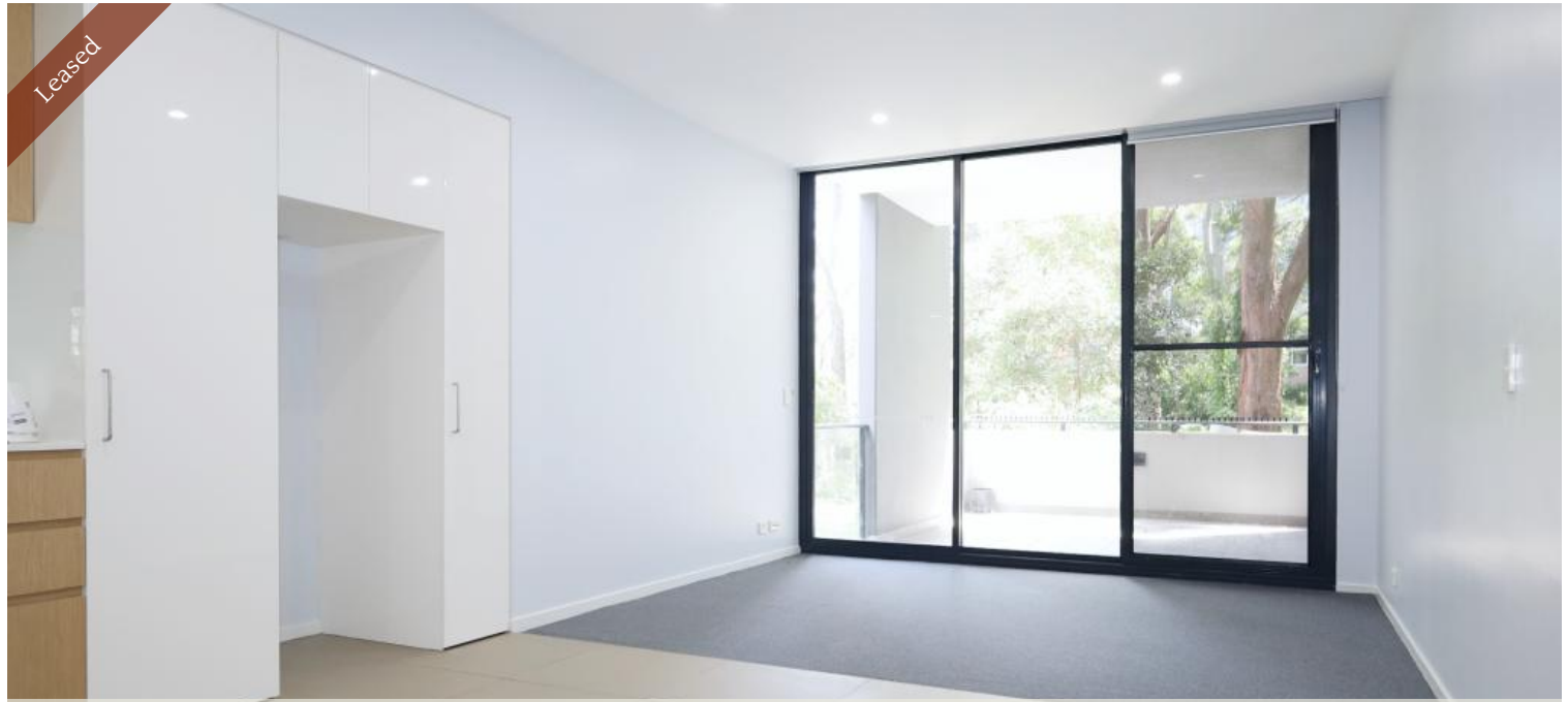
2, 8 Saunders Close, Macquarie Park