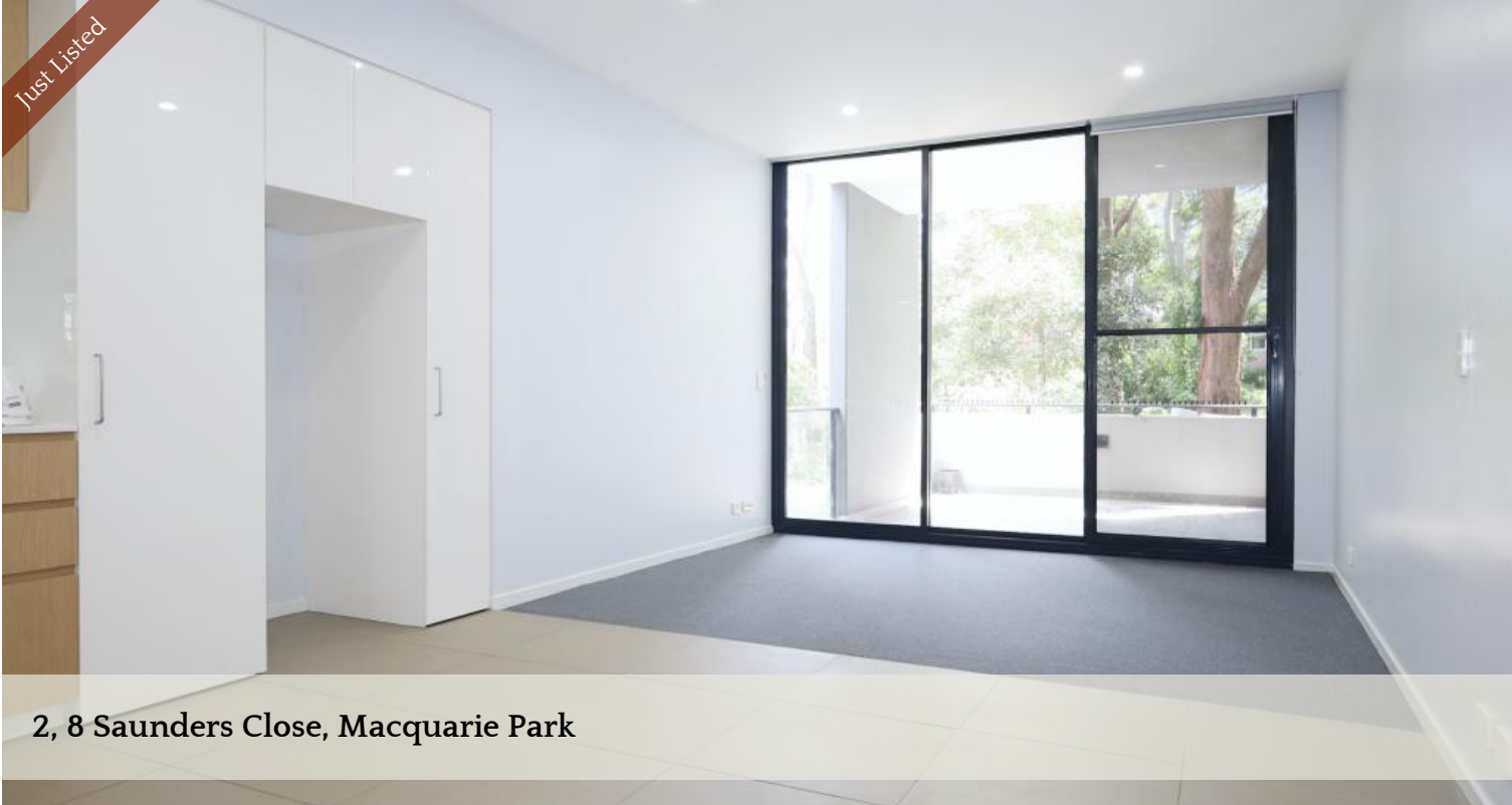
2, 8 Saunders Close, Macquarie Park