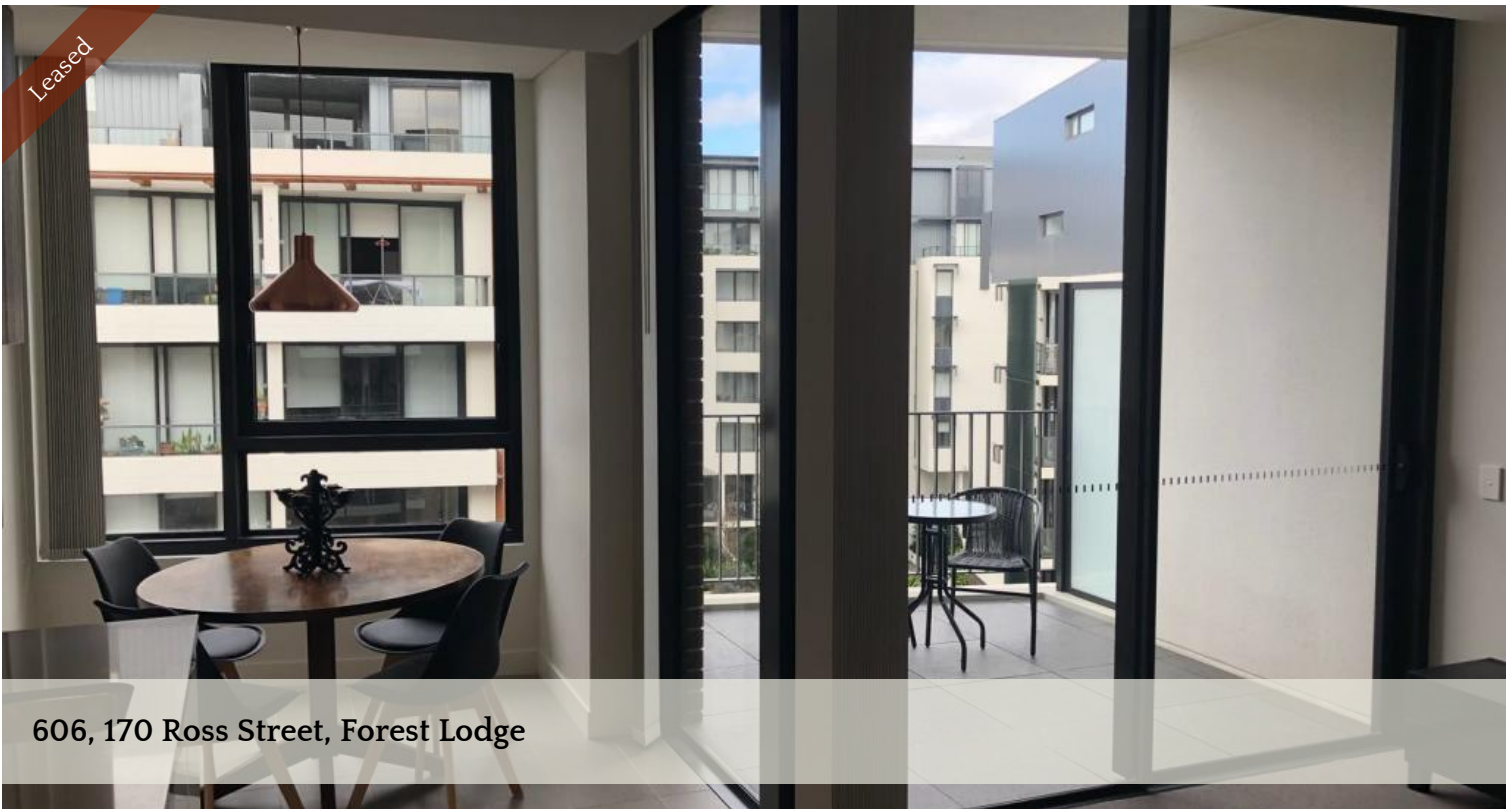
606, 170 Ross Street, Forest Lodge