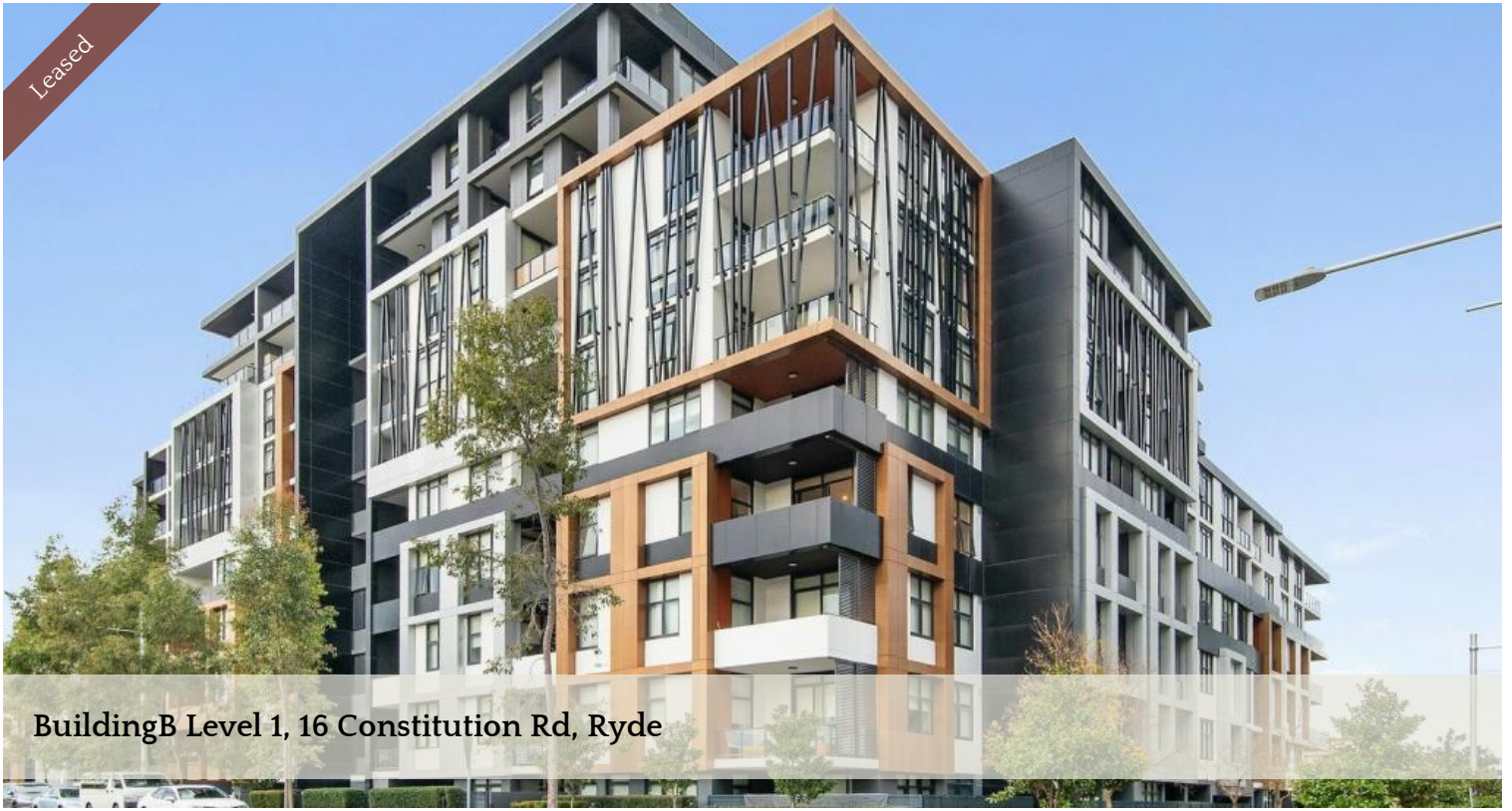
Building B Level 1, 16 Constitution Rd, Ryde