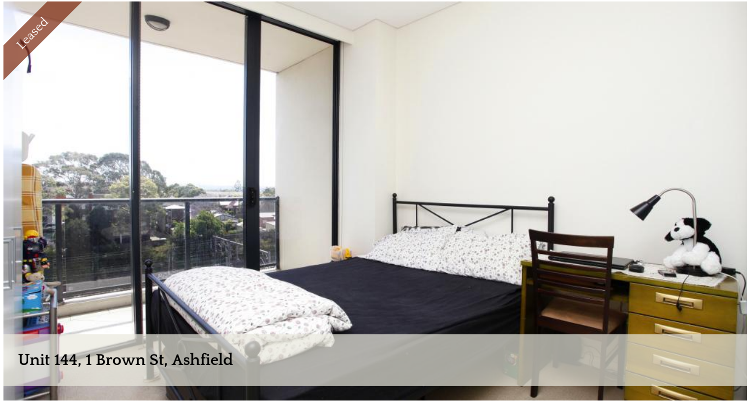
Unit 144, 1 Brown St, Ashfield