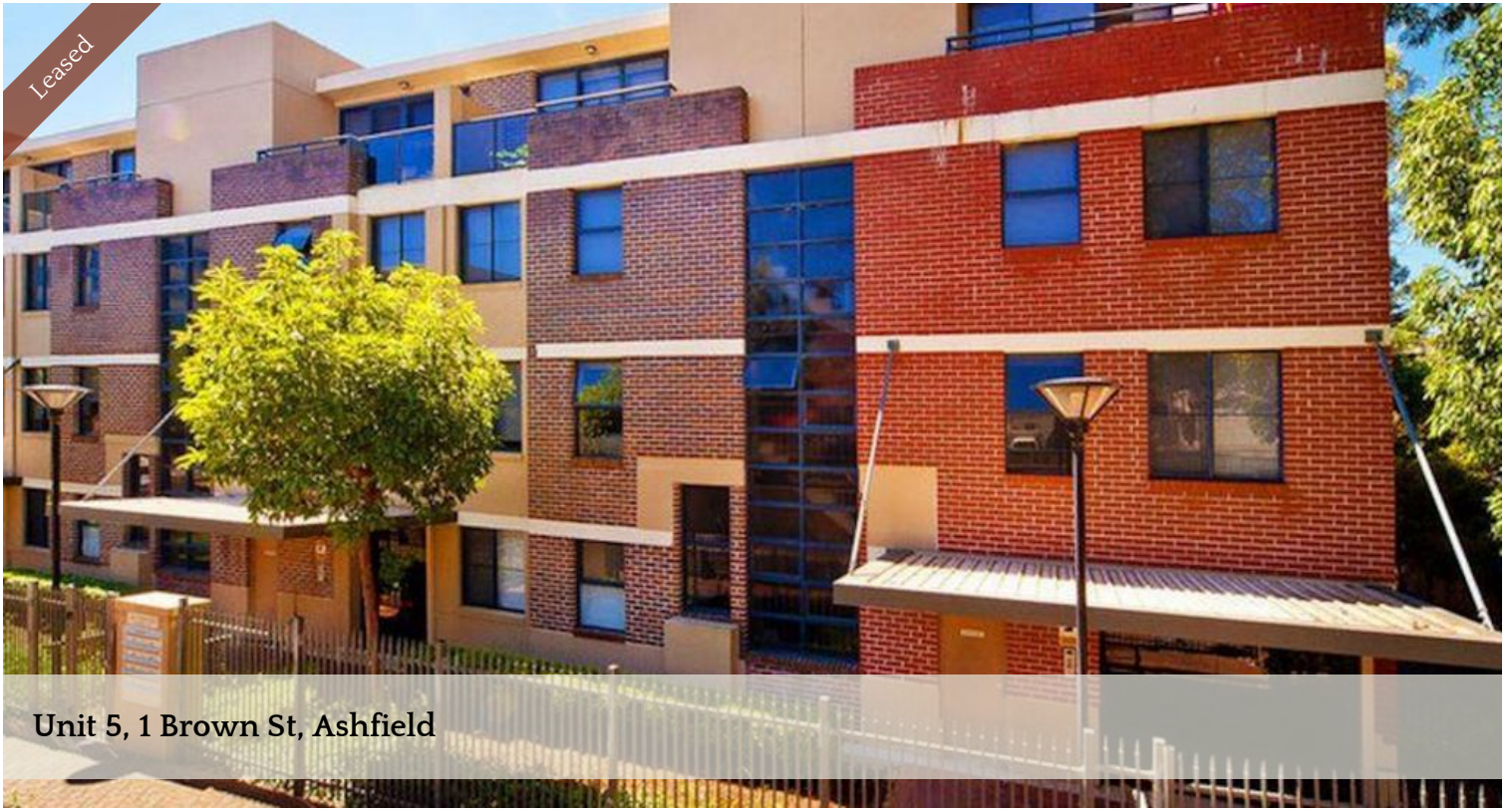
Unit 5, 1 Brown St, Ashfield