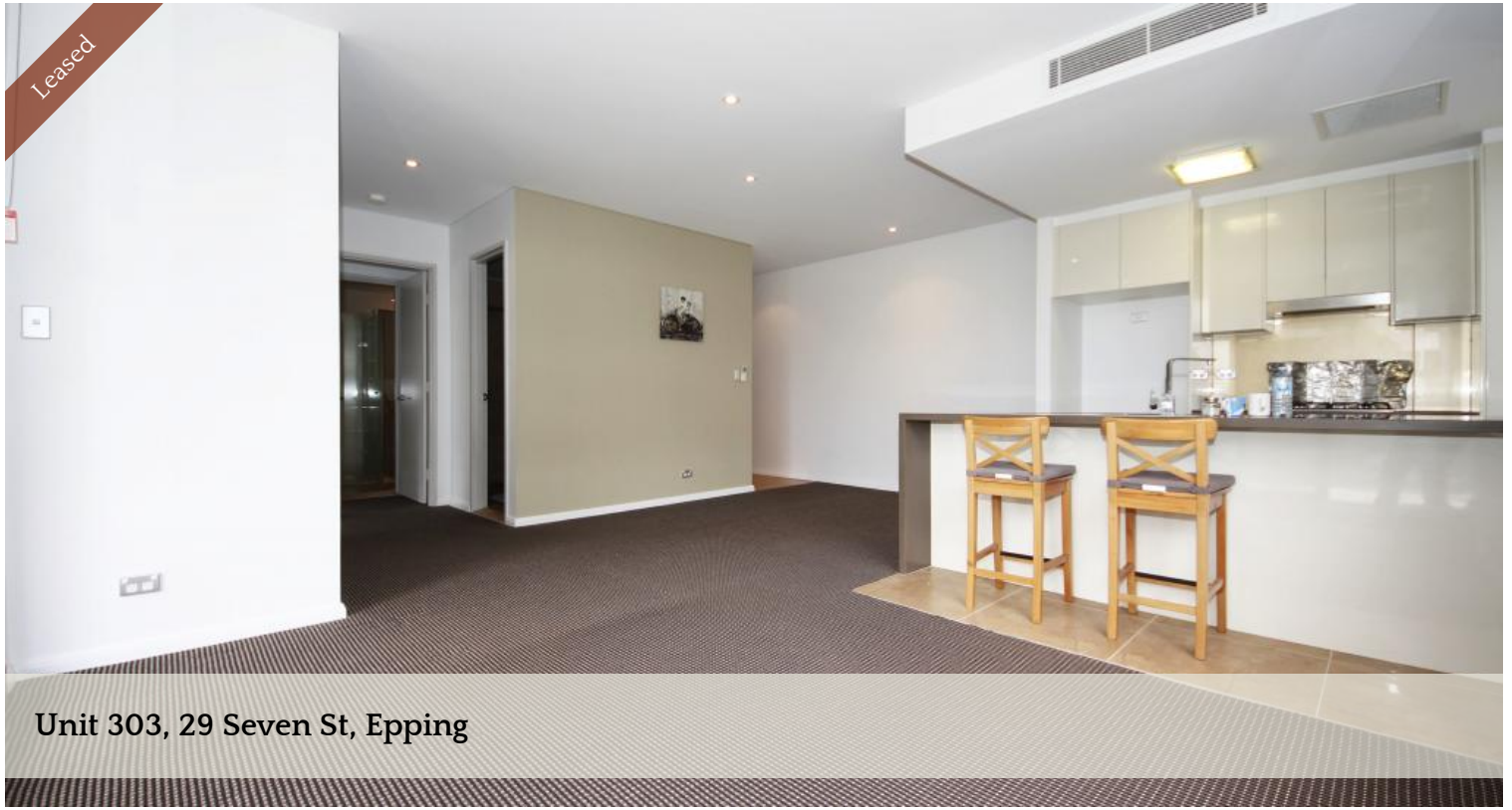
Unit 303, 29 Seven St, Epping