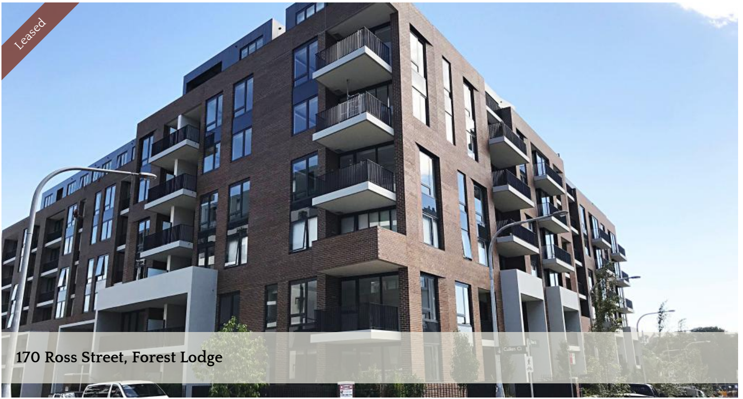
170 Ross Street, Forest Lodge