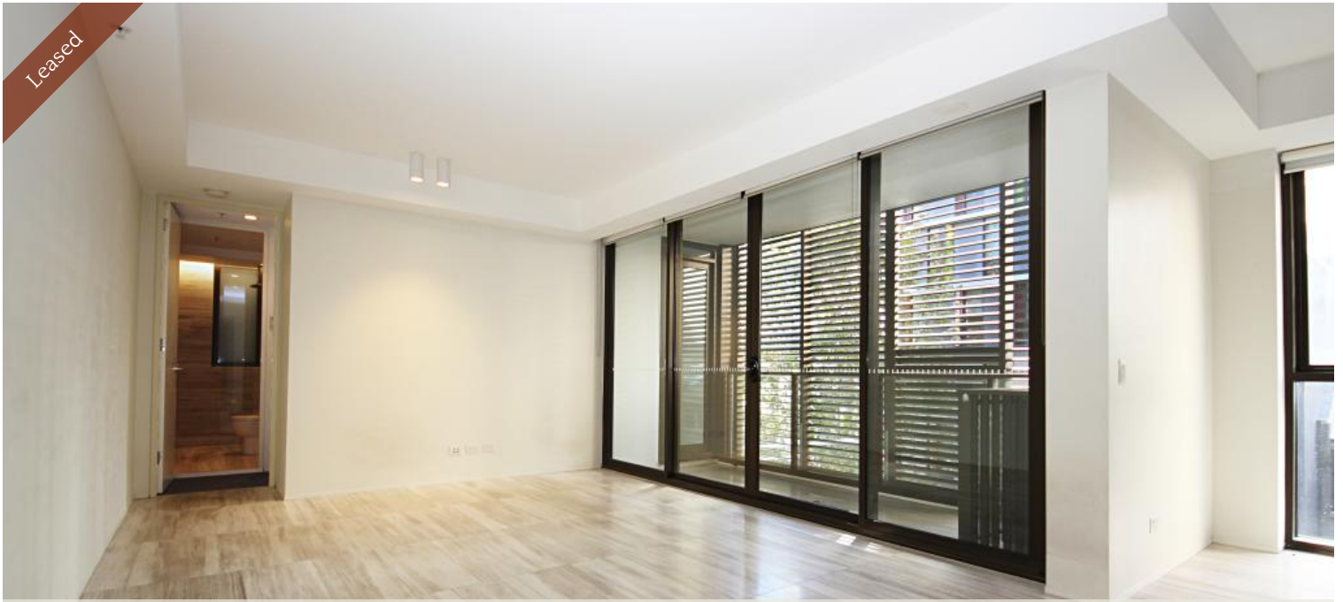
S3.10, 178 Thomas Street, Haymarket