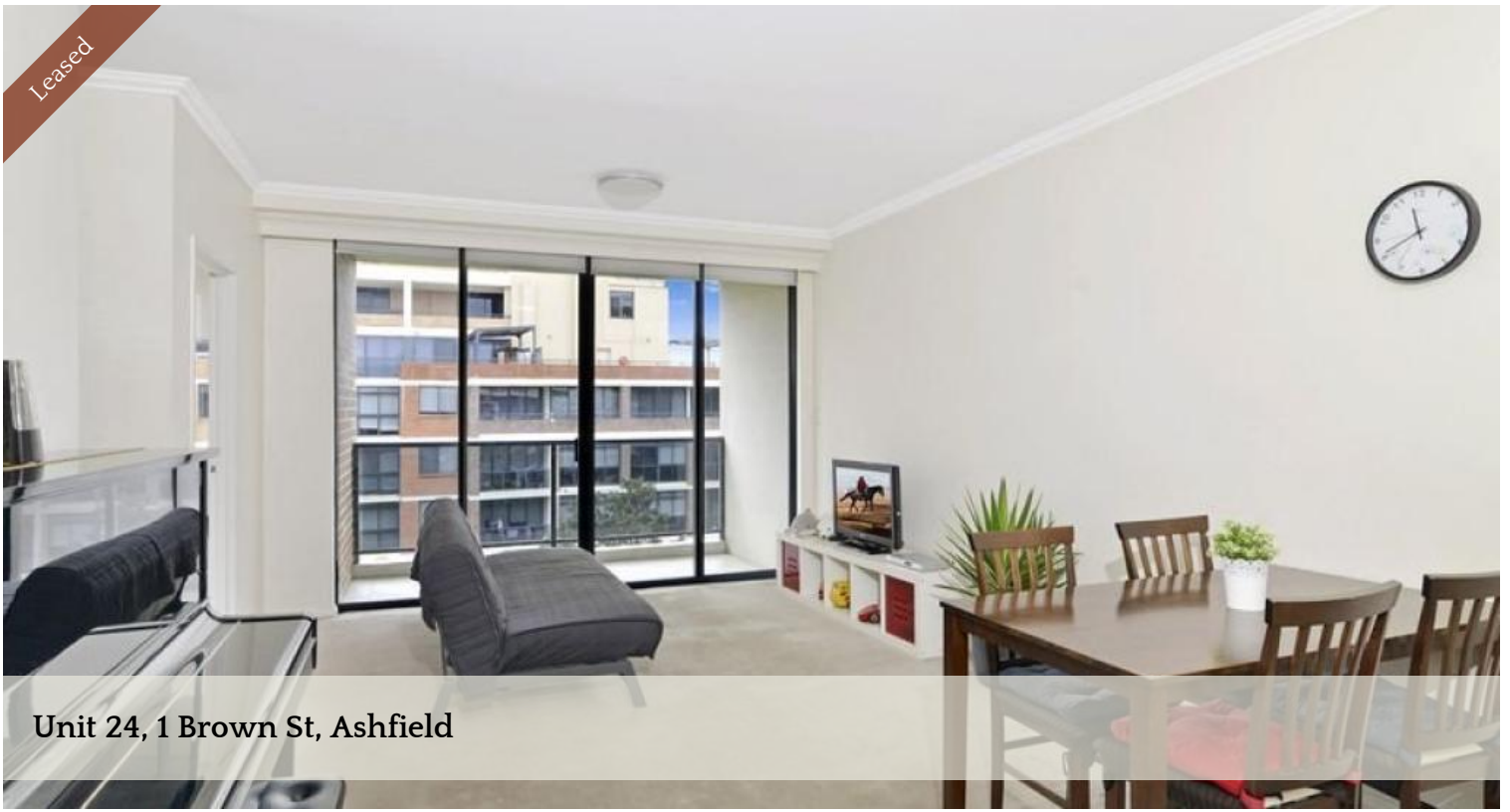
Unit 24, 1 Brown St, Ashfield