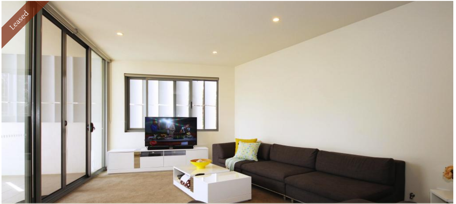
B305, 2 Rowe Drive, Greenacre