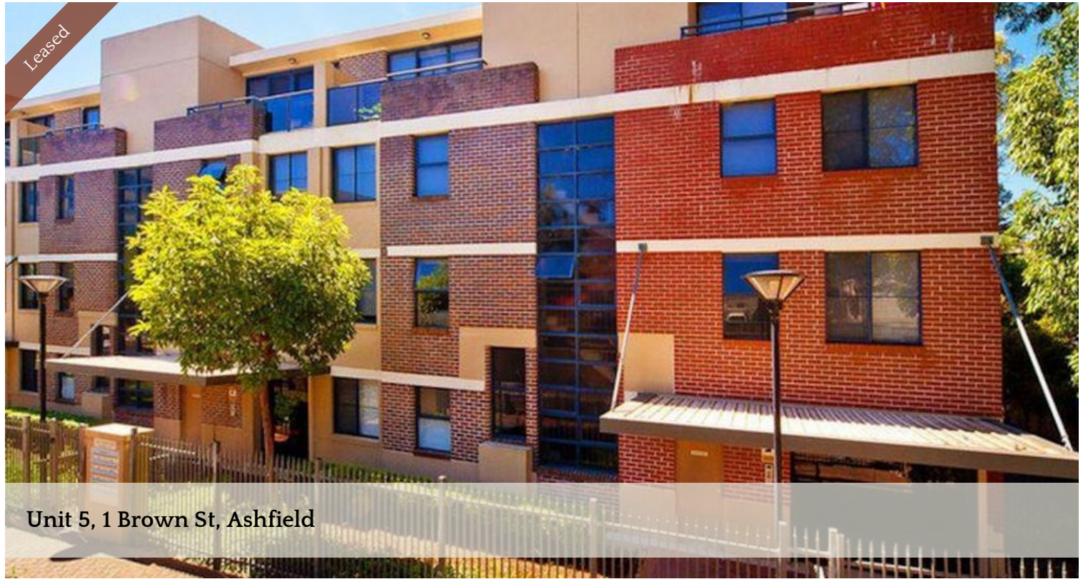
Unit 5, 1 Brown St, Ashfield