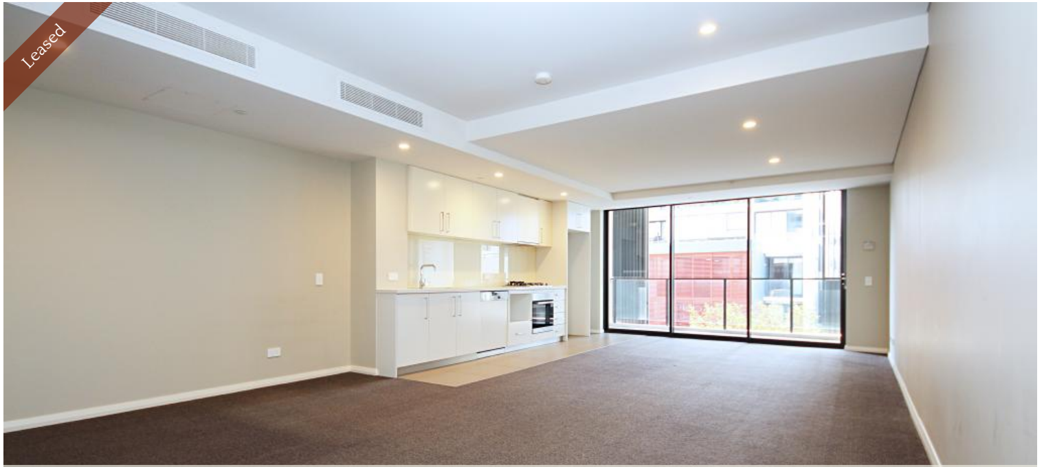
Unit 55, 9 Atchison St, St Leonards