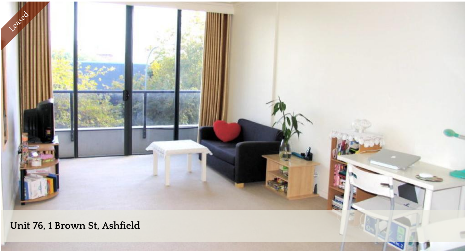
Unit 76, 1 Brown St, Ashfield