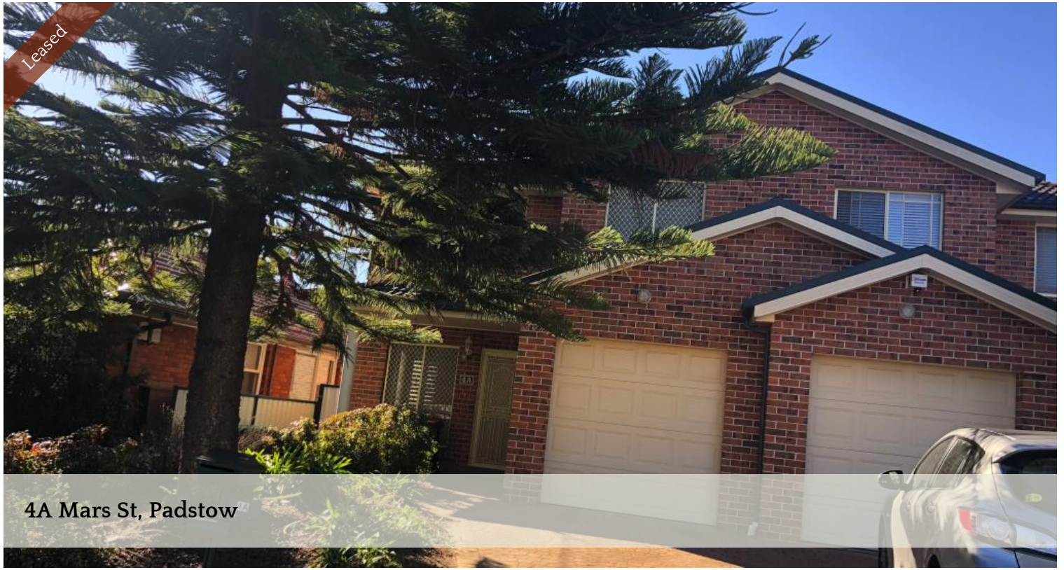
4A Mars St, Padstow