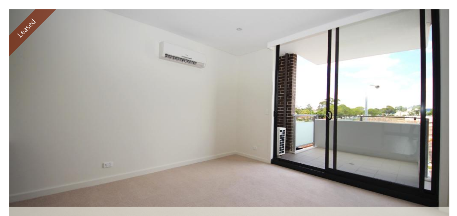
Unit 3, 14 Victa St, Campsie