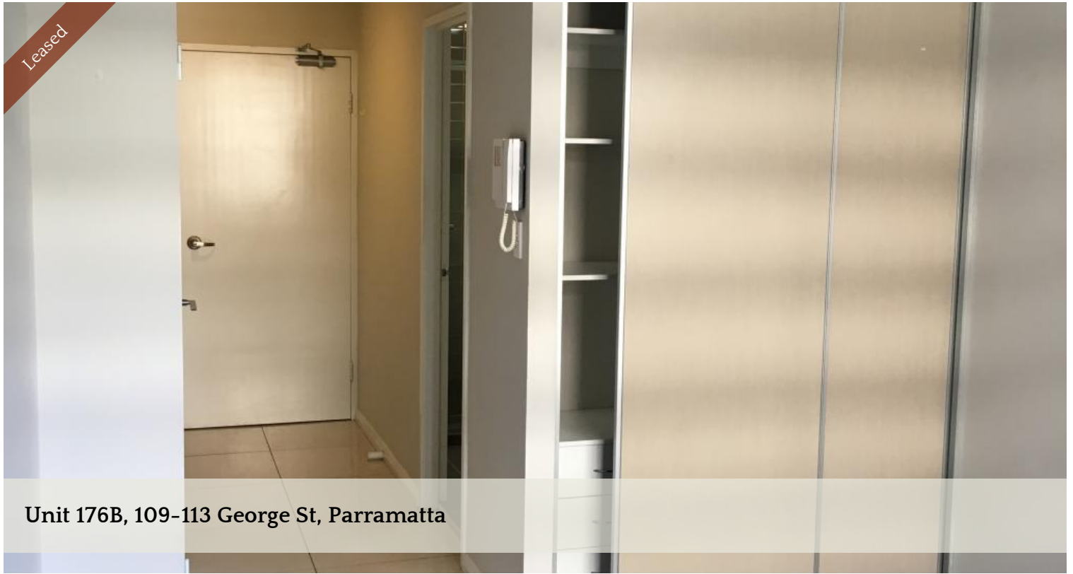
Unit 176B, 109-113 George St, Parramatta