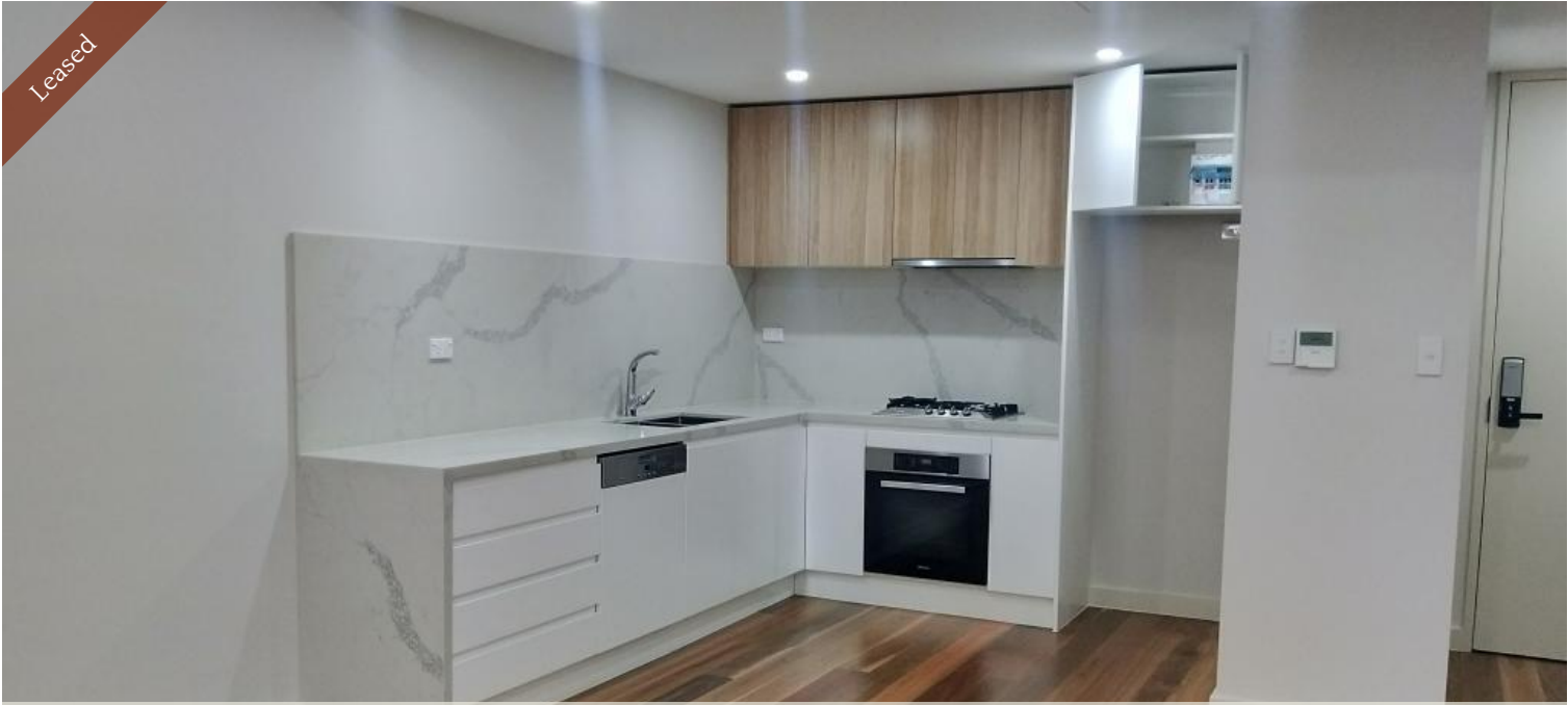
Unit 102, 50-52 East St, Five Dock