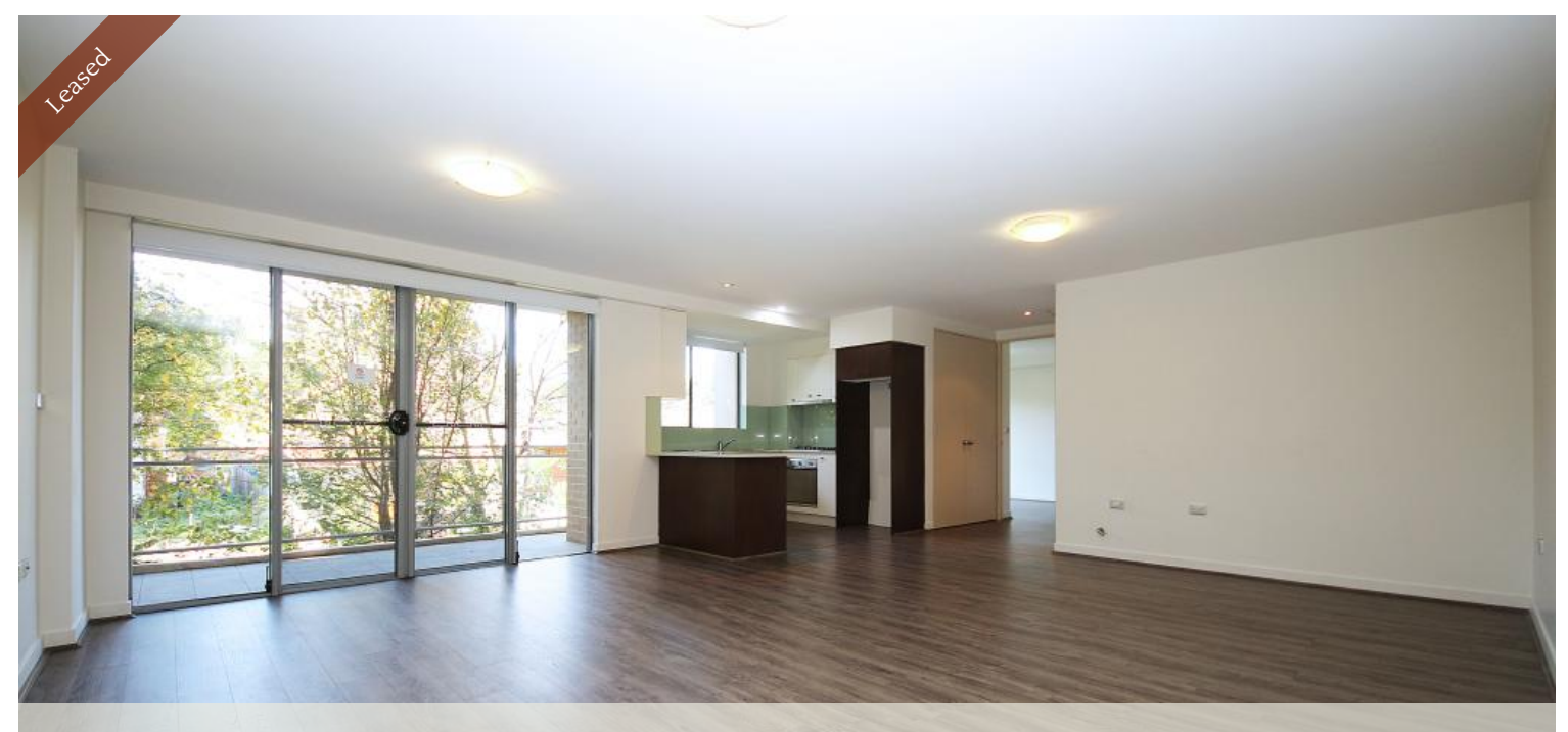
Unit 9, 2-4 Hilts Rd, Strathfield